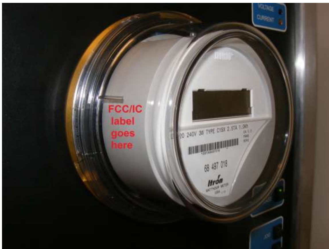
Figure 2: External Label Location