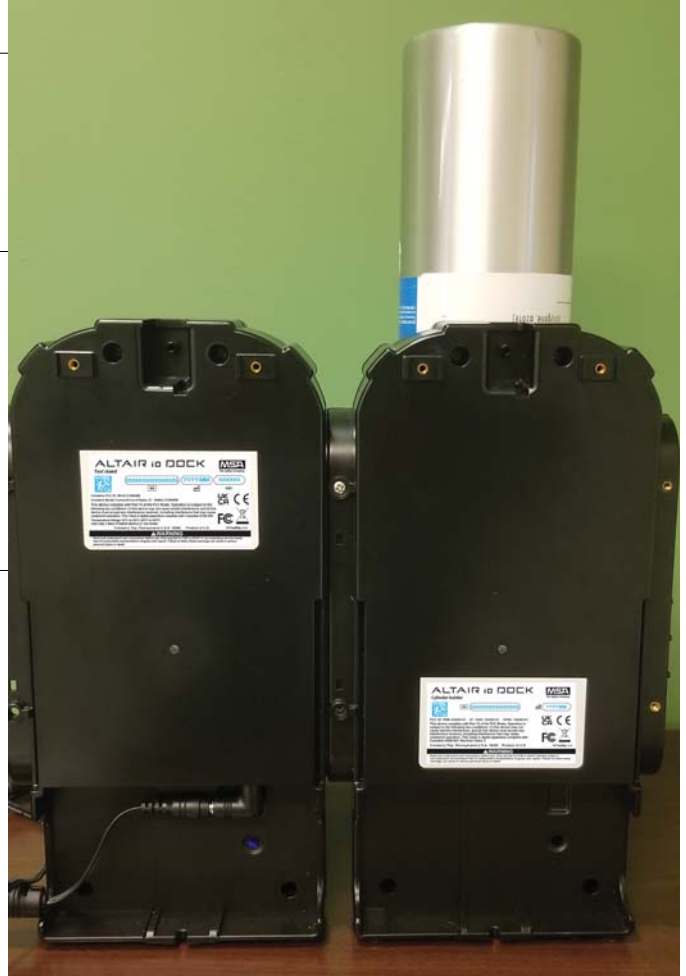
Label Locations: Note each cylinder holder has its own label.