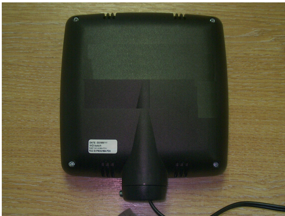
POSITION OF FCC ID LABEL