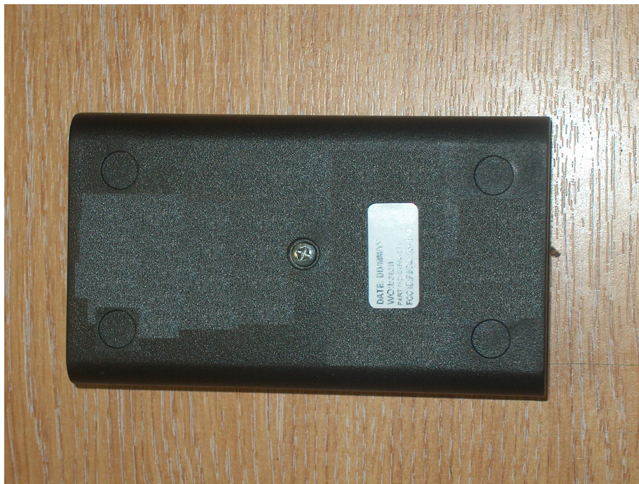
POSITION OF FCC ID LABEL