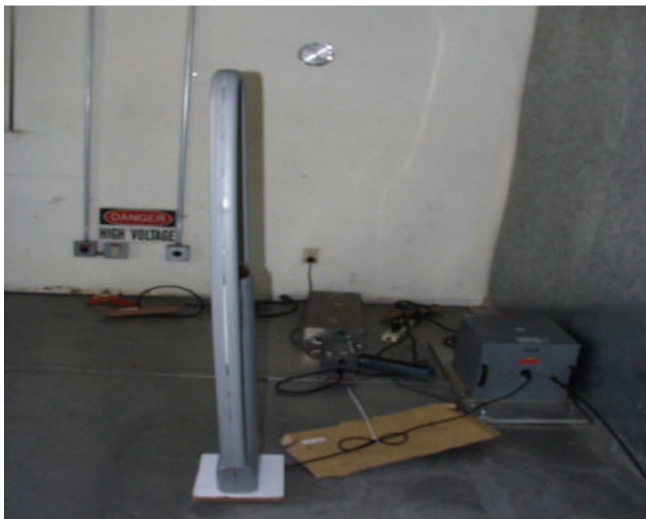
Mono-Guard Conducted Emission Setup