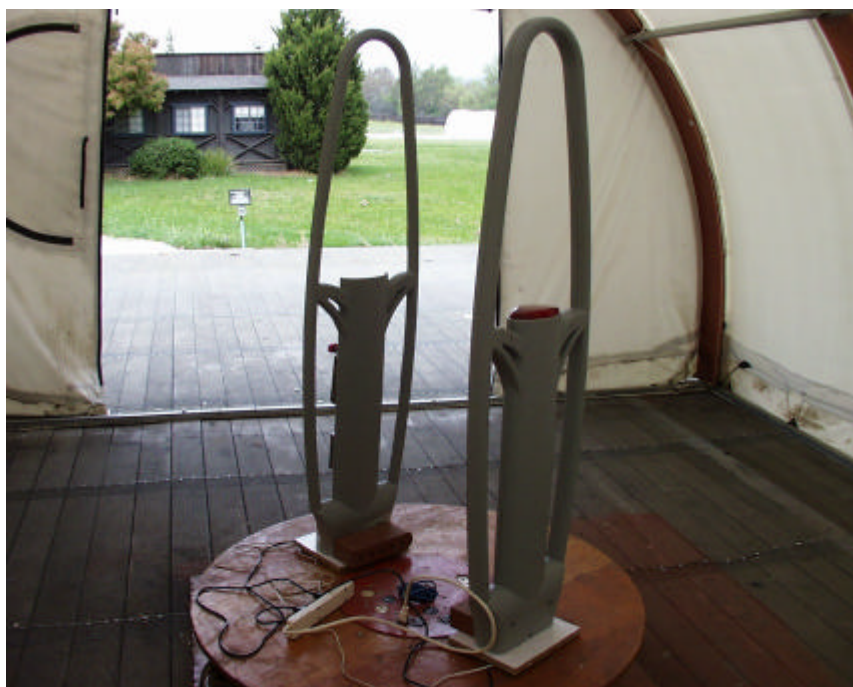
Multi-Guard Radiated Emission Test Setup