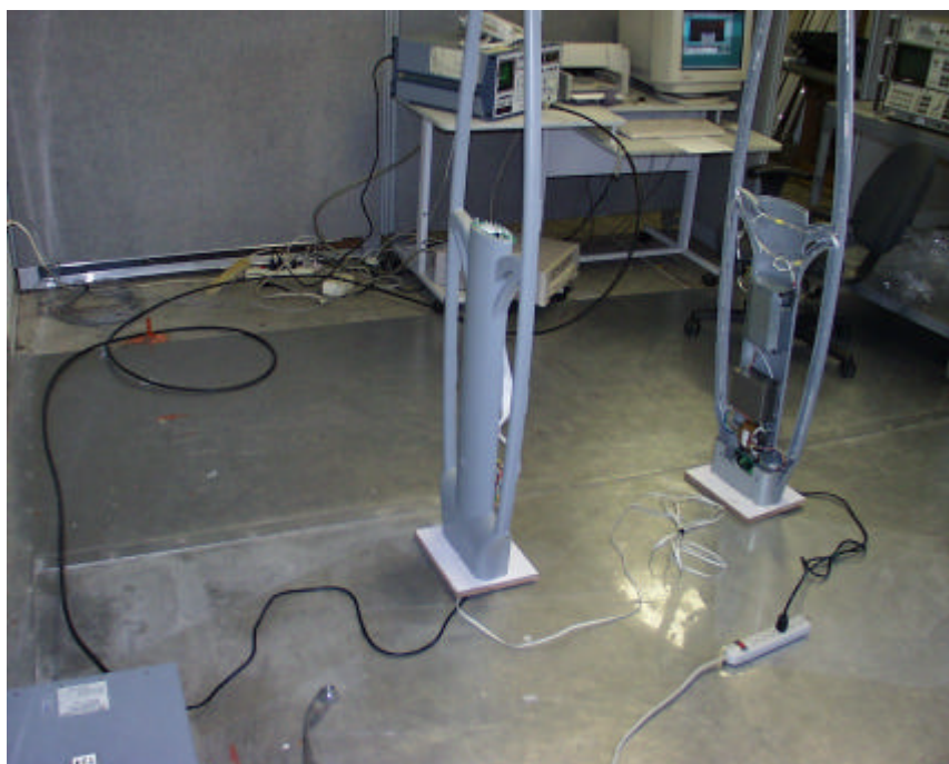
Multi-Guard Conducted Emission Setup