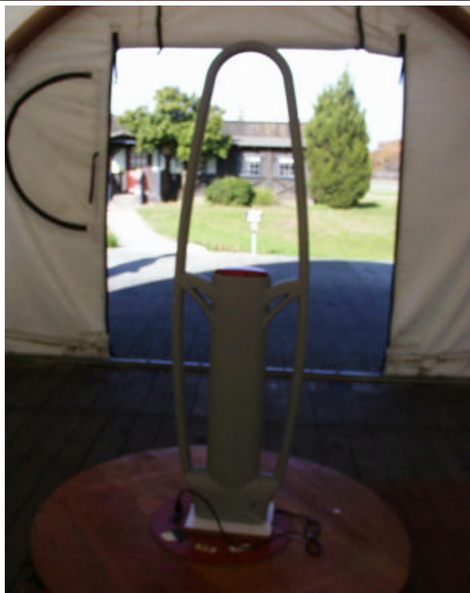
Mono-Guard Radiated Emission Test Setup