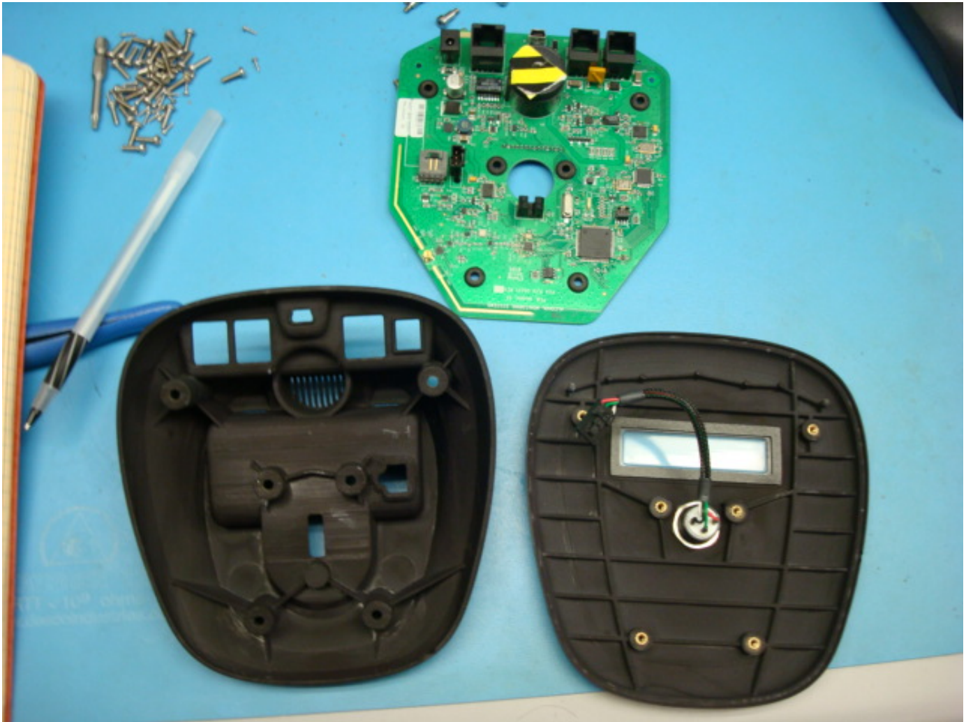
SM03 Internal Photo: Full Product