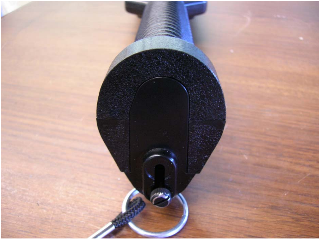
Battery End – Cover Open