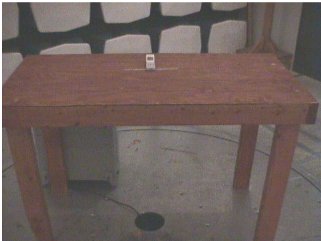
Figure 2. Photograph of Part 24 Tests Setup