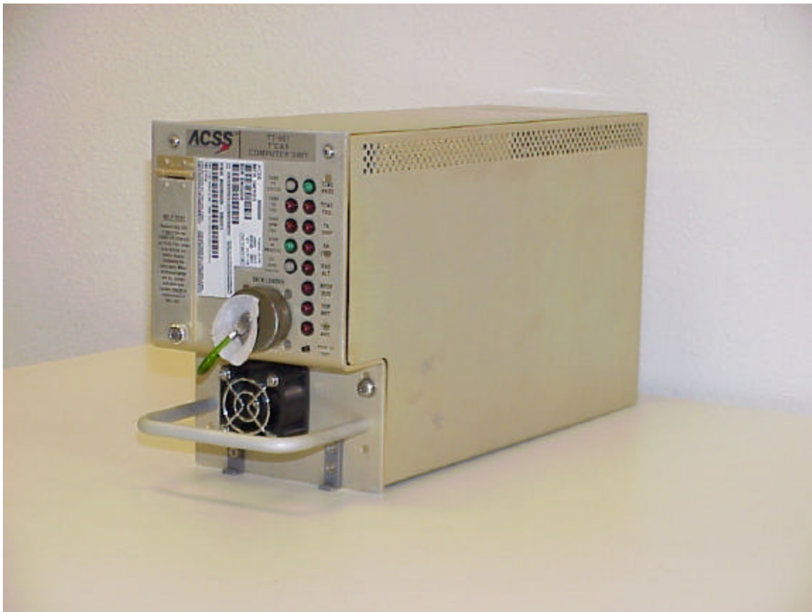
Figure 4: Unit Front With Name Plate Showing