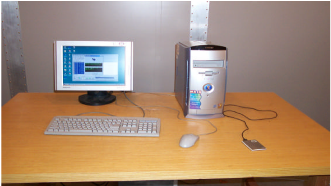
Photograph 1 : Setup for Conducted Emissions