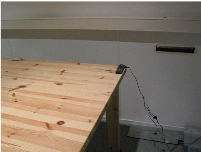
Picture 2 AC powerline conducted emission measurement Bluetooth TX / WLAN TX