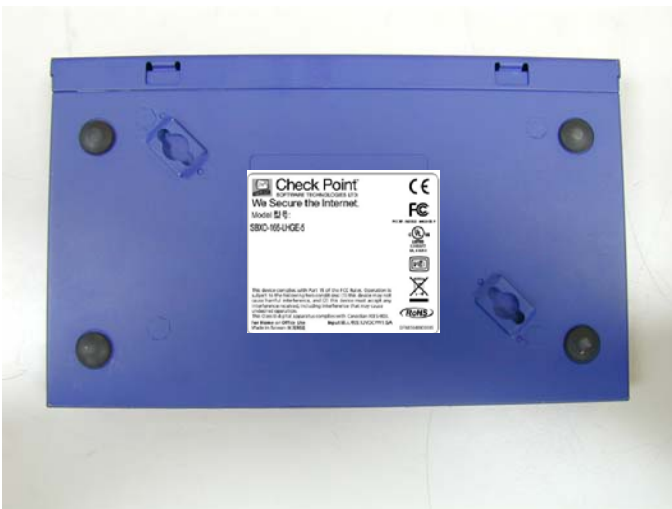
Model No.: SBXD-166LHGE-5