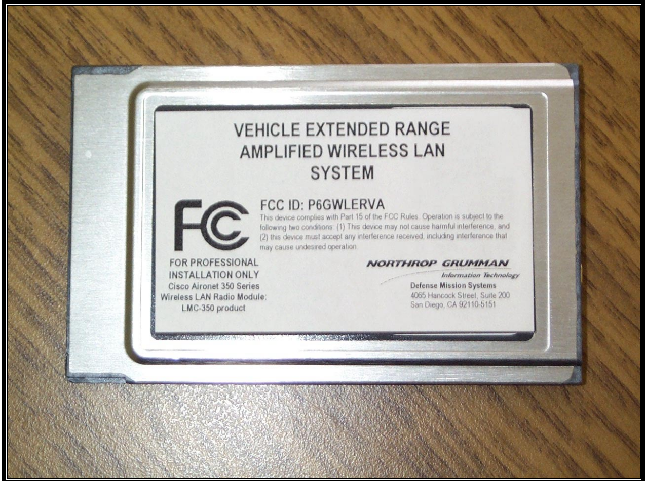
PHOTOGRAPH 1; LOCATION OF IDENTIFICATION LABEL ON WLAN CARD