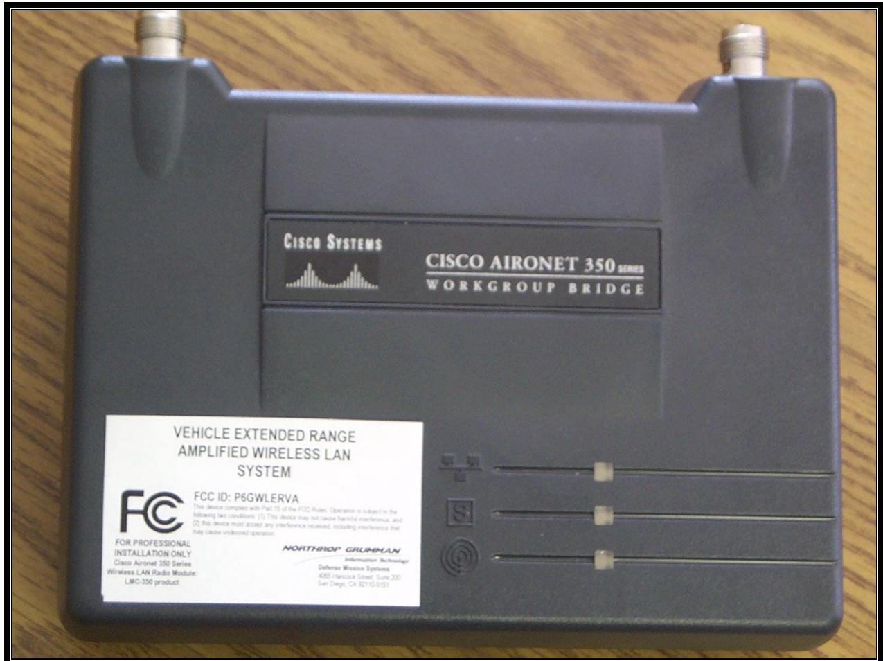
PHOTOGRAPH 2: LOCATION OF IDENTIFICATION LABEL ON BRIDGE