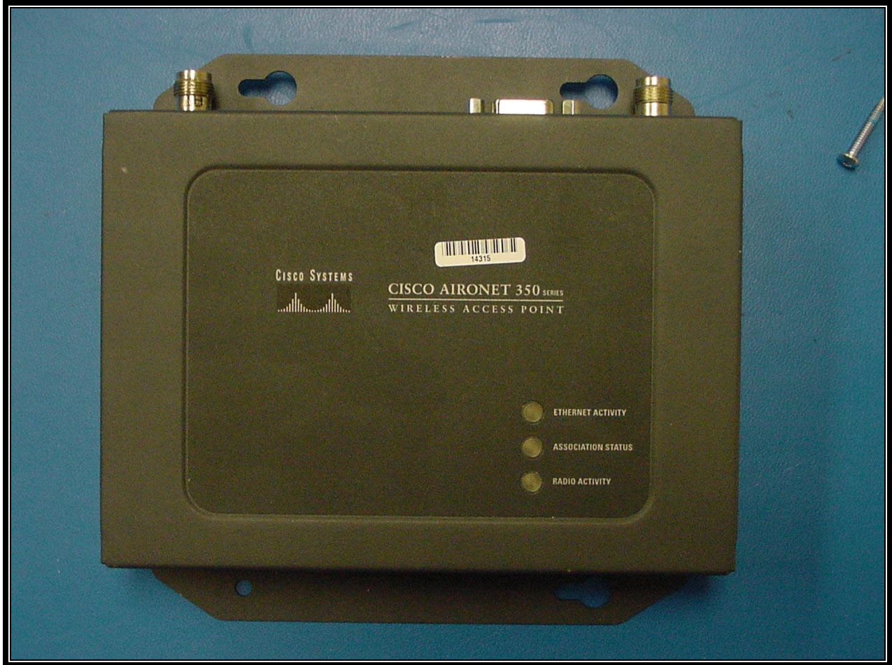
PHOTOGRAPH 10: FRONT VIEW OF ACCESS POINT