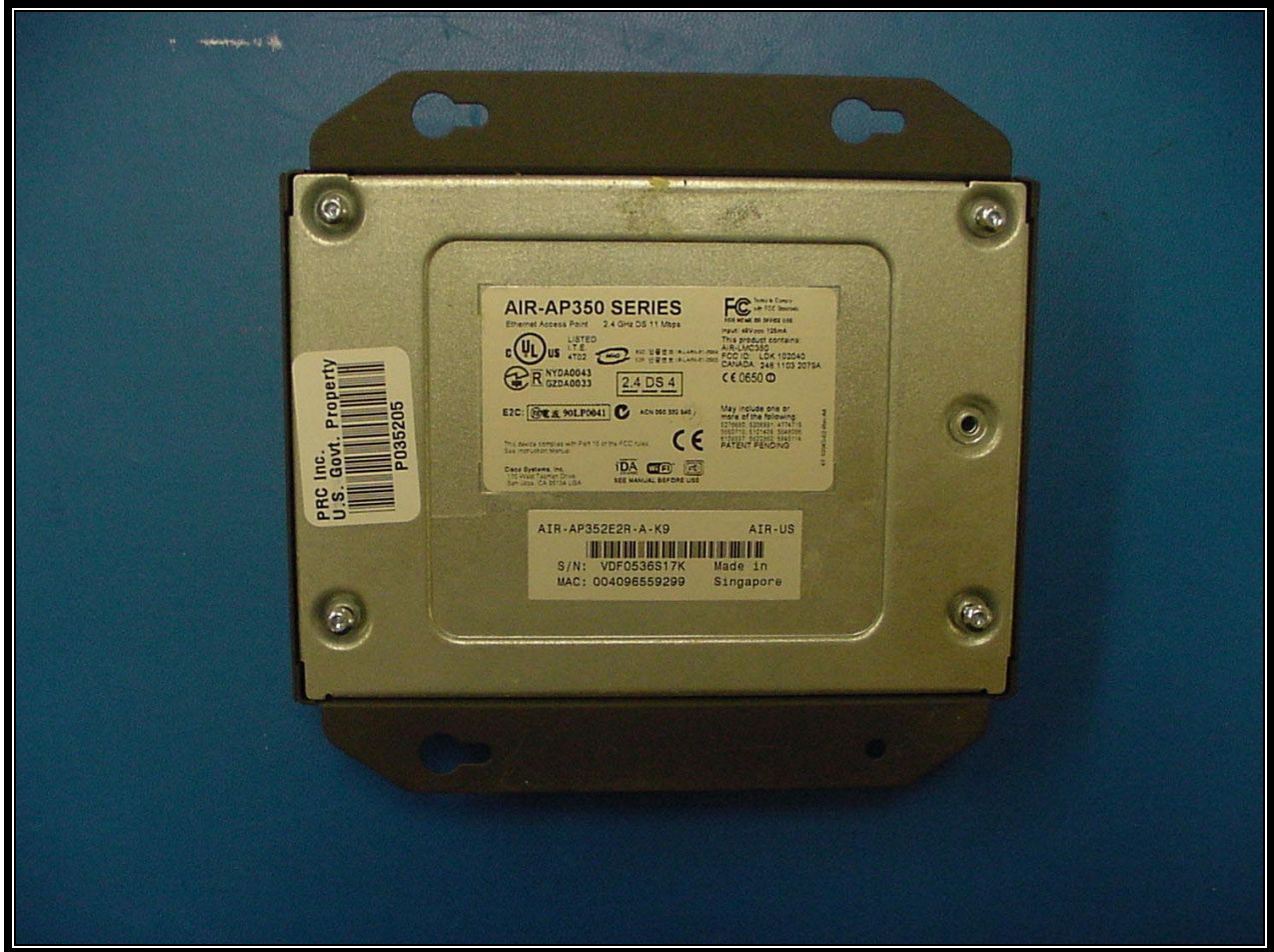
PHOTOGRAPH 11: BACK VIEW OF ACCESS POINT