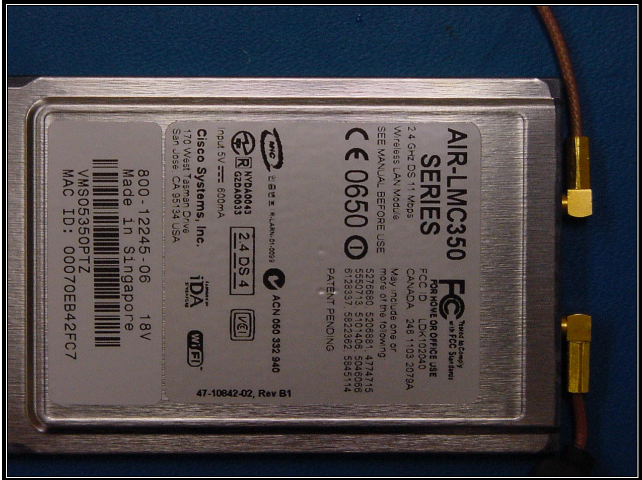
PHOTOGRAPH 13: TOP VIEW OF PCMCIA CARD

Report number: 2002050 FCC: Part 15.247 Industry Canada: RSS-139 FCC ID: P6G-WLVERVA M/N: NGIT Vehicle Extended Range Amplified WLAN System