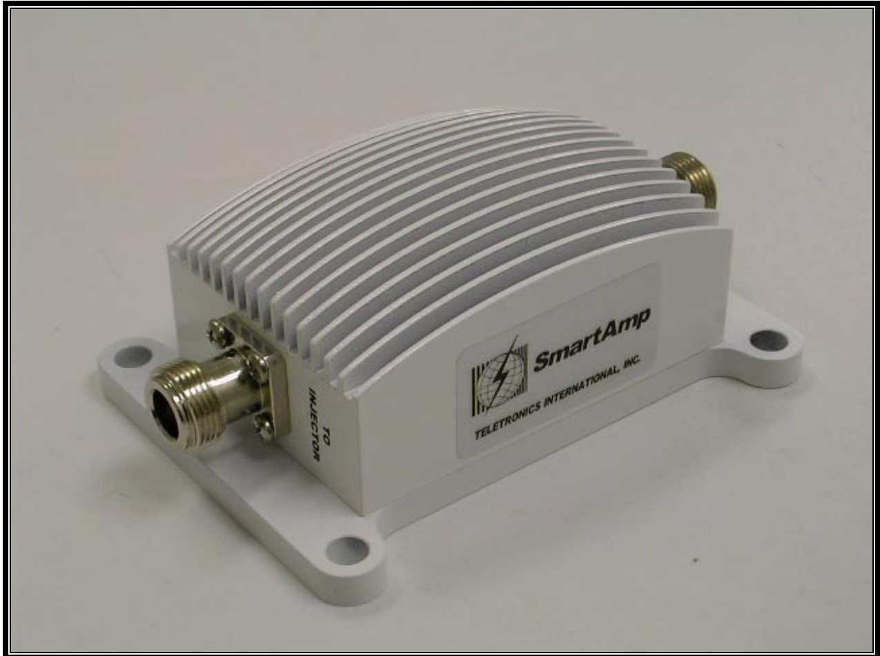
PHOTOGRAPH 15: 1W AMPLIFIER