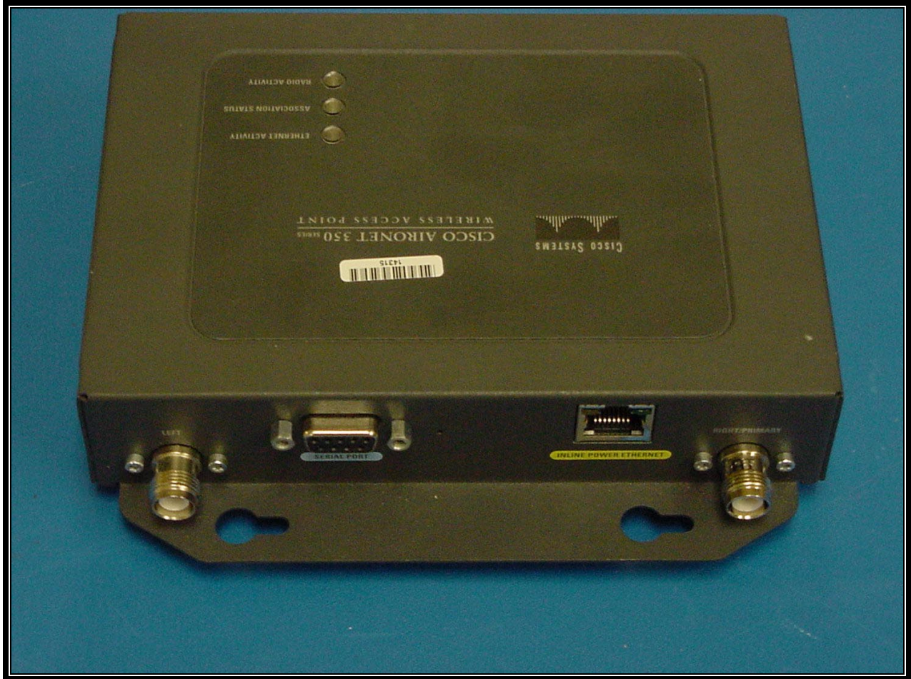
PHOTOGRAPH 12: REAR VIEW OF ACCESS POINT