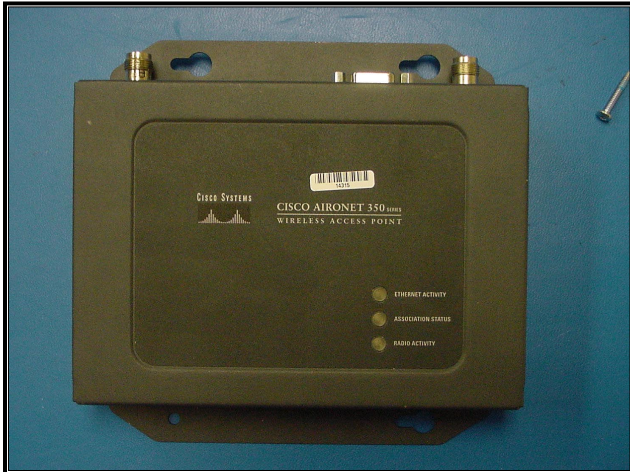
PHOTOGRAPH 7: FRONT VIEW OF ACCESS POINT