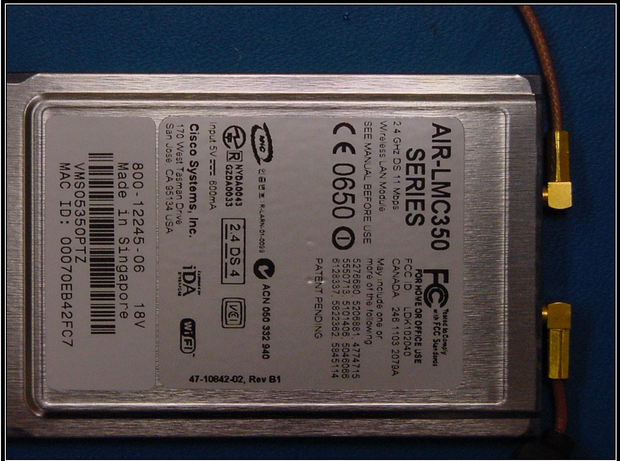
PHOTOGRAPH 12: TOP VIEW OF PCMCIA CARD

Report number: 2002051 FCC: Part 15.247 Industry Canada: RSS-210 FCC ID: P6G-WLERFA M/N: NGIT Fixed Site Extended Range (Amplified) WLAN