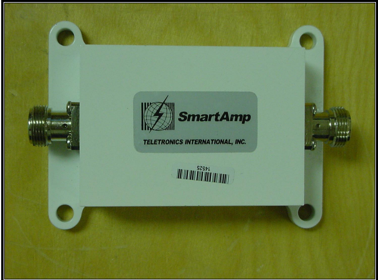
PHOTOGRAPH 11: 500MW AMPLIFIER

Report number: 2002051 FCC: Part 15.247 Industry Canada: RSS-210 FCC ID: P6G-WLERFA M/N: NGIT Fixed Site Extended Range (Amplified) WLAN