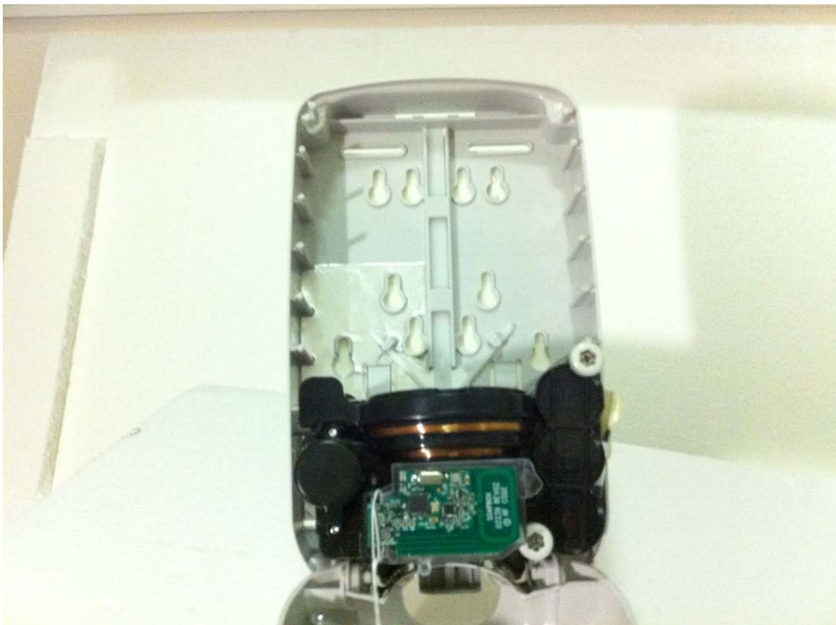
Enclosure opened as for routine servicing of contents; EUT circuit board visible at bottom.