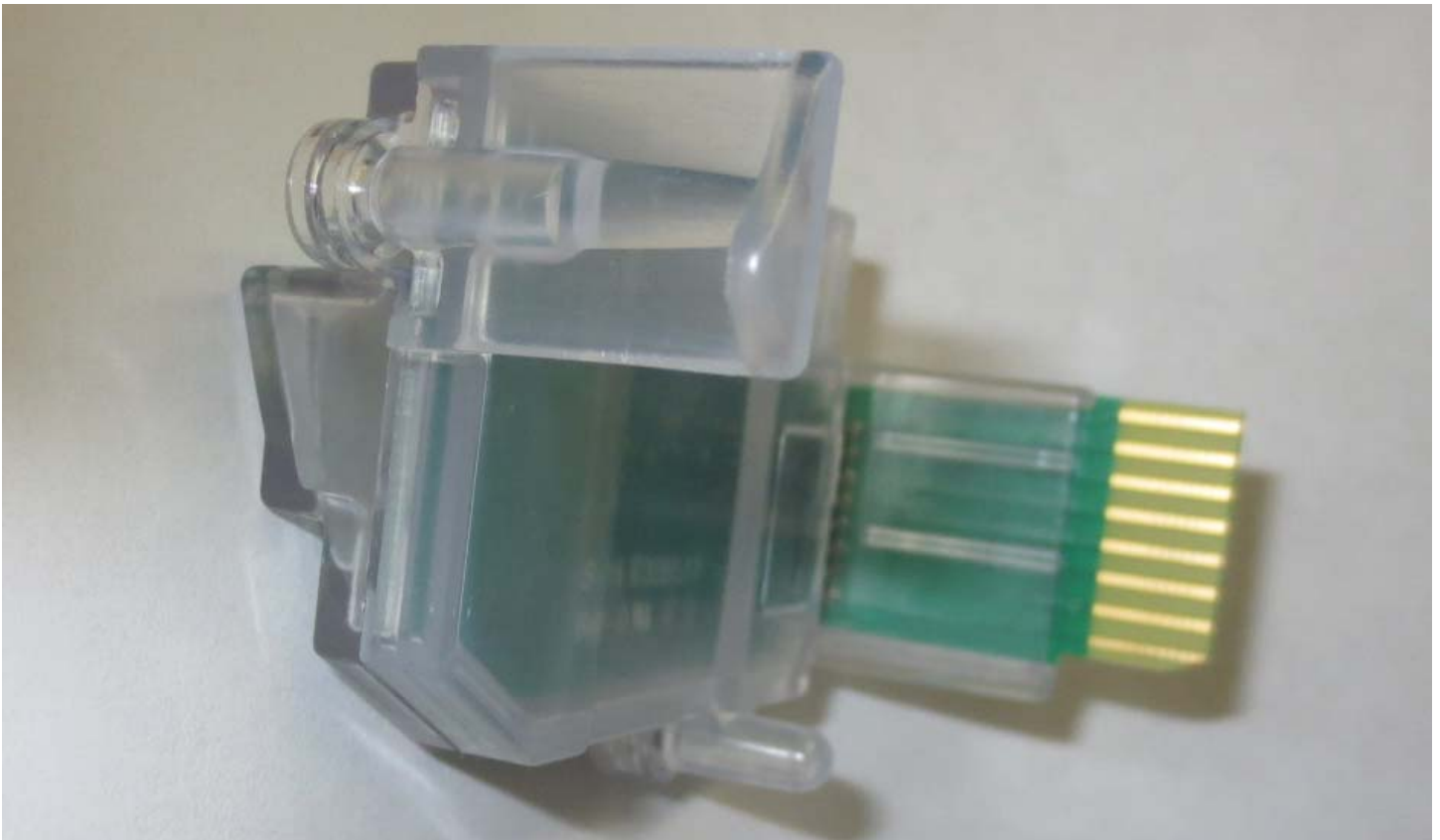
End View – Non-connector Side