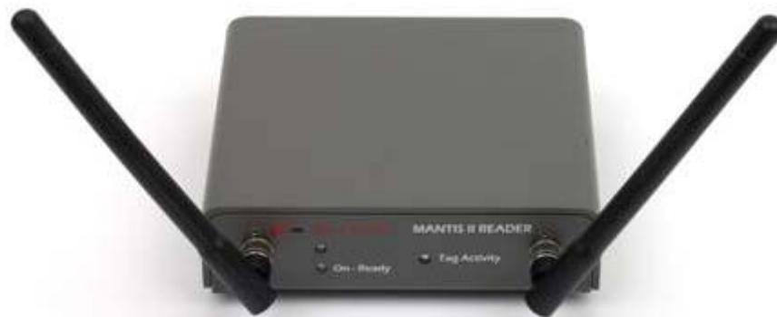
Figure 2.1 – Mantis™ II 433.92 MHz Reader (front view) shown with standard ¼-wave helical antennae.

Three LEDs are mounted on the front of the Mantis™ II 433.92 MHz Reader .