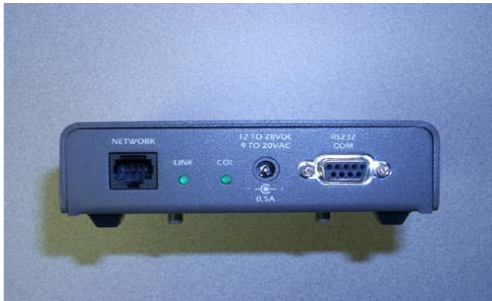
Figure 2.2 – Mantis™ II 433.92 MHz Reader (rear view) showing connections for Network/Ethernet (RJ-45), Power, and Serial/COM (RS-232).

Several connections are housed on the back of the Mantis™ II 433.92 MHz Reader .