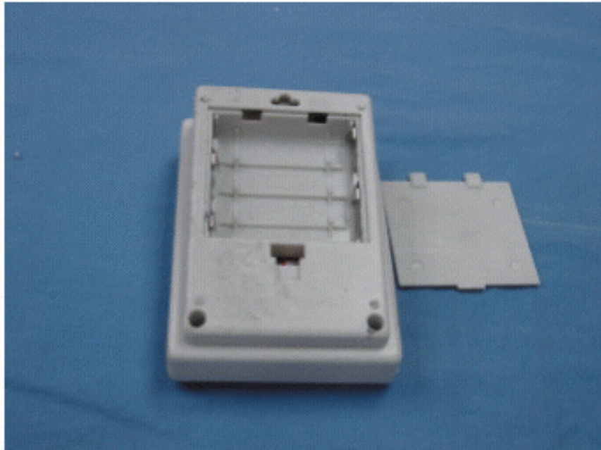
Figure 4 Inside of the EUT