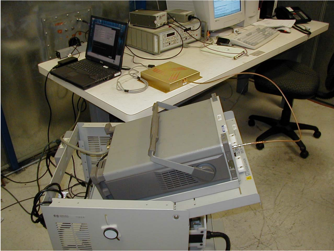
ANTENNA CONDUCTED EMISSIONS TEST SETUP