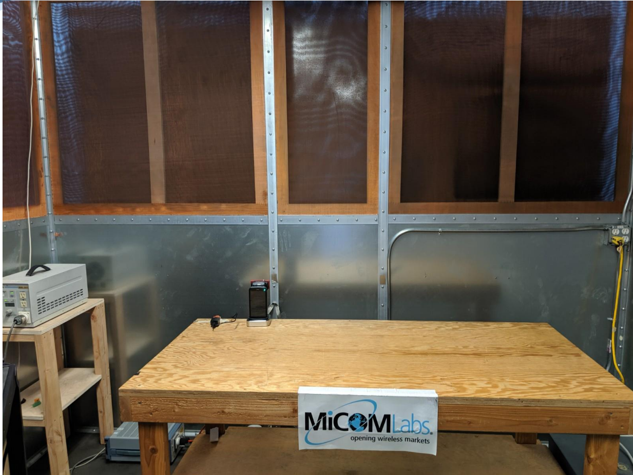
Conducted AC Wireline Front