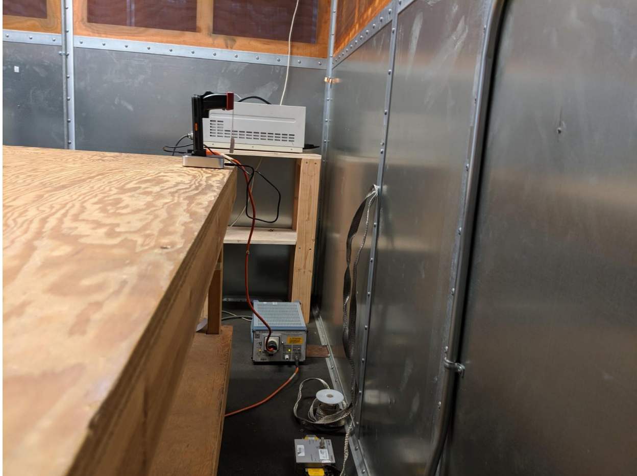
Conducted AC Wireline Back