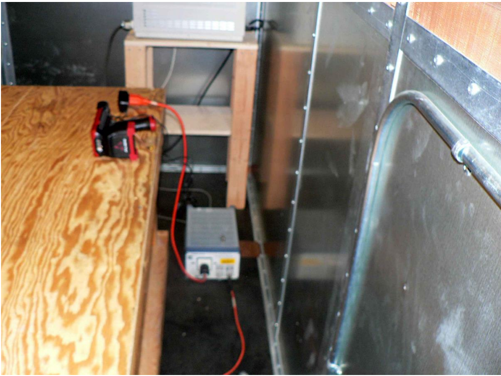
TX Spurious 1-10 GHz