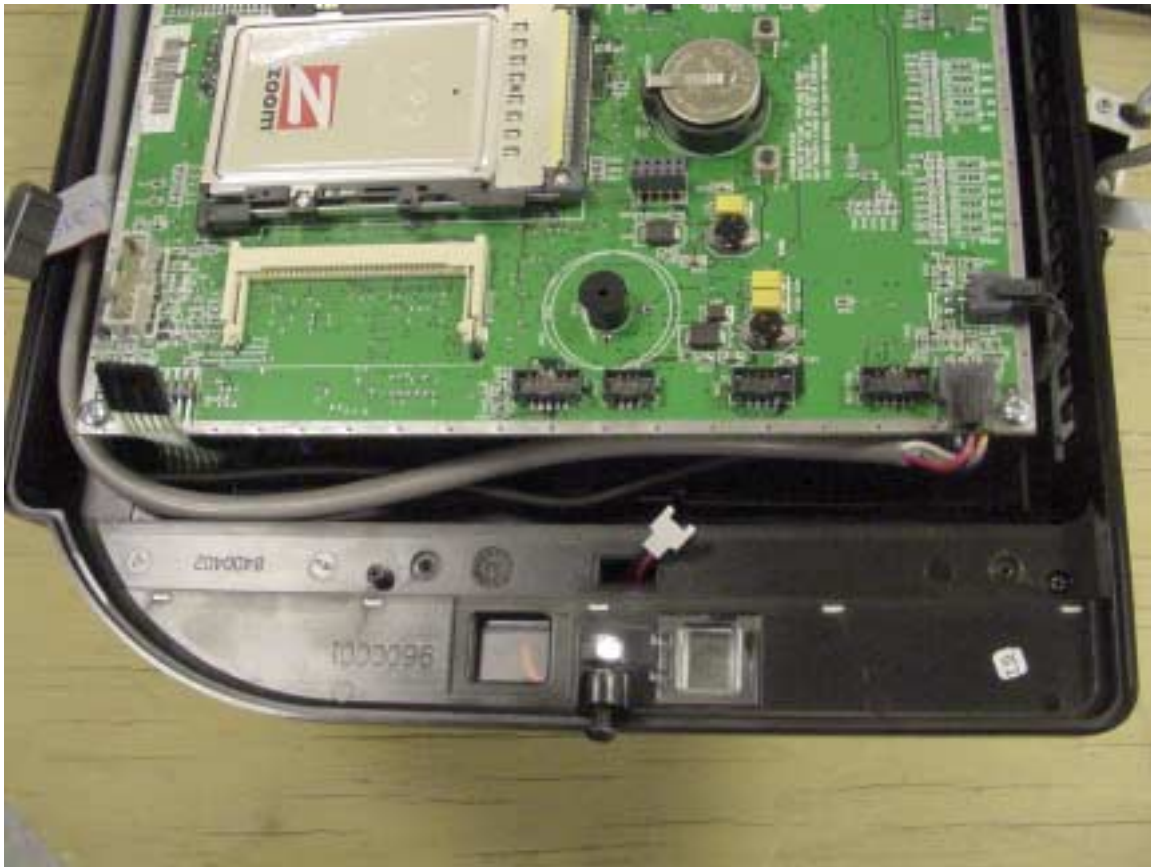
Inside of EUT, white connector on bottom of photo goes to antenna.