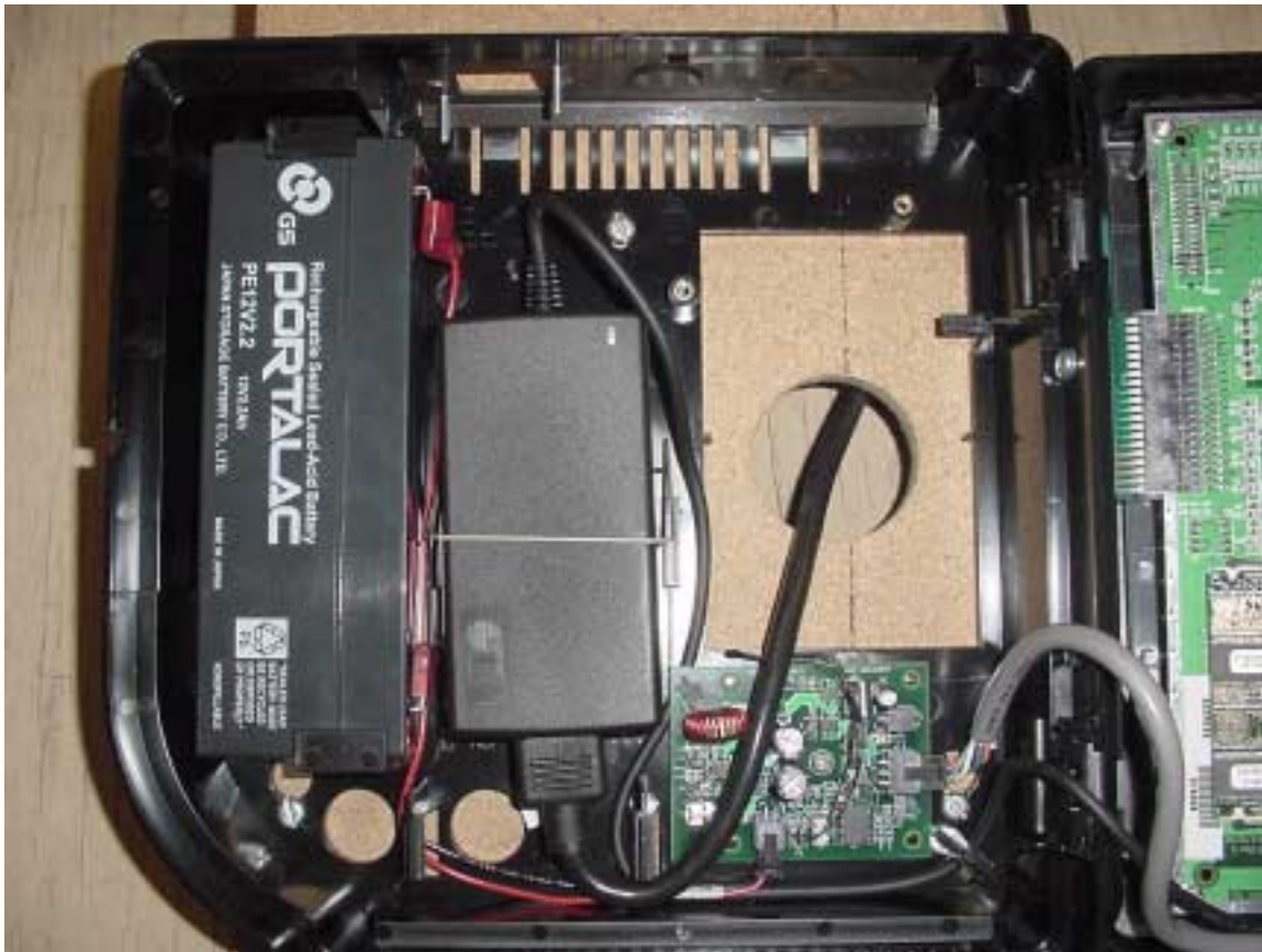
Inside view of EUT showing power supply, battery backup.