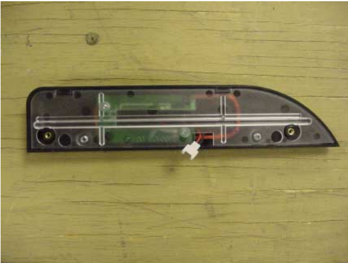
Antenna assembly removed from EUT.