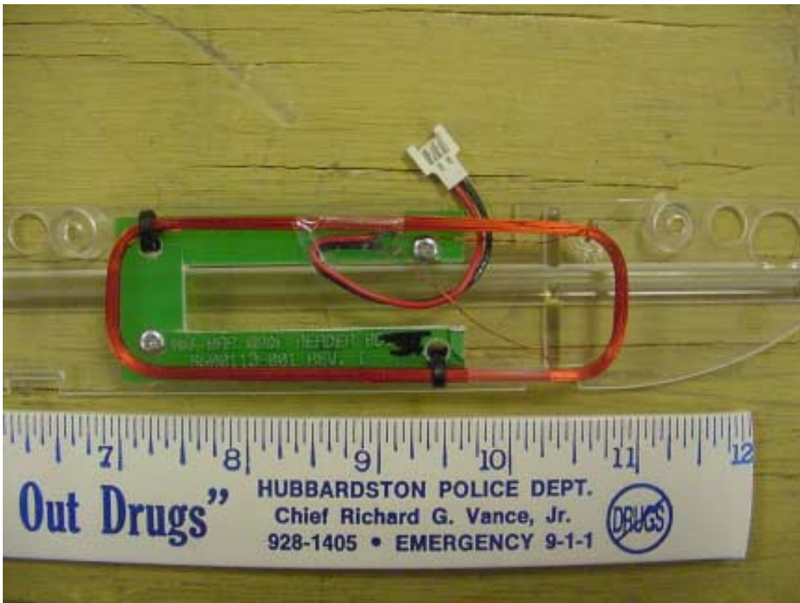
Close up of antenna