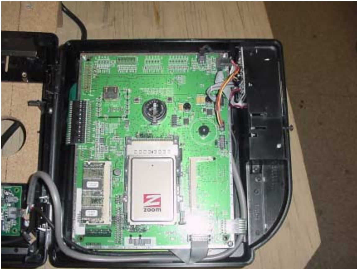
Interior View of EUT, Transceiver module is located at top right.