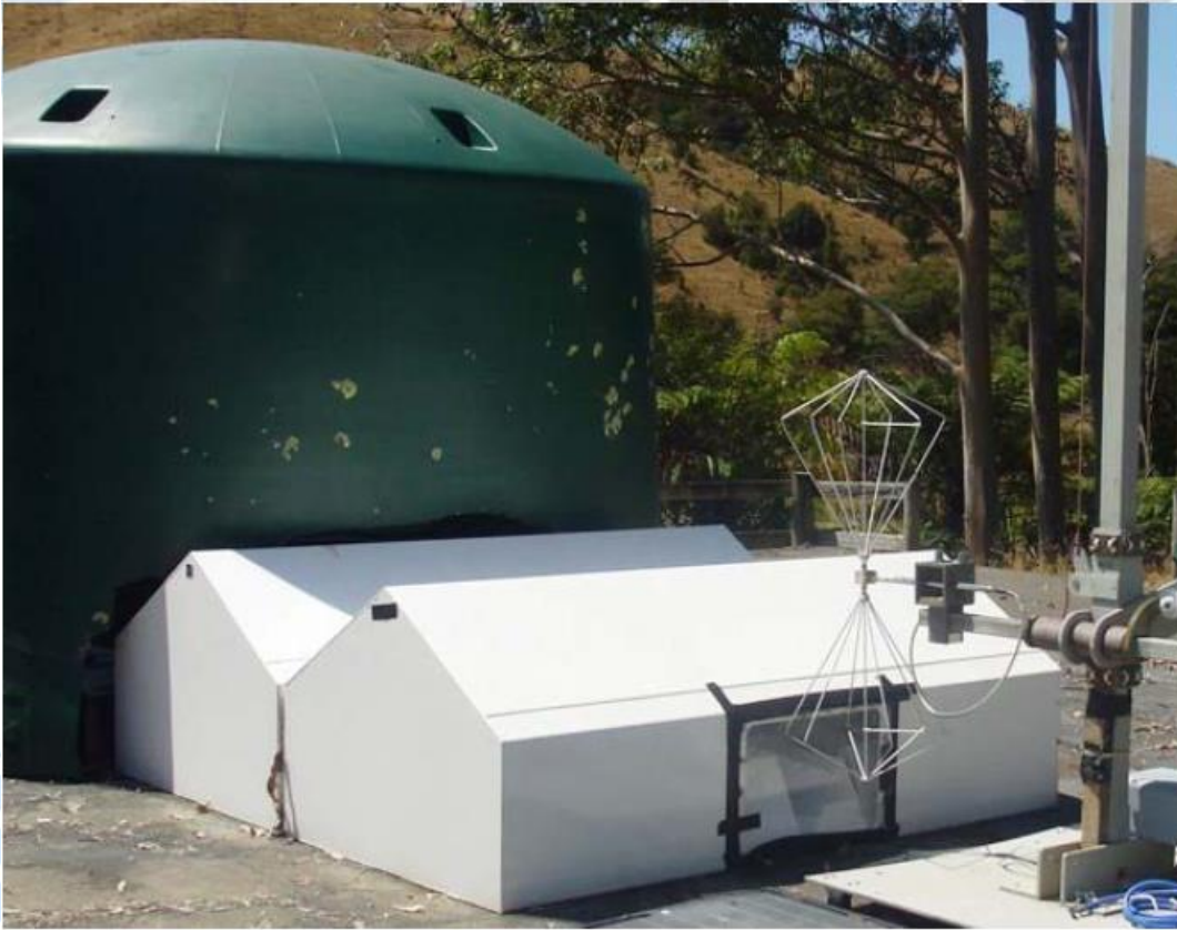
Test Shed showing the use of a Log Periodic Antenna