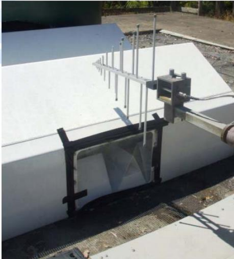
Test Shed showing the use of a Horn Antenna