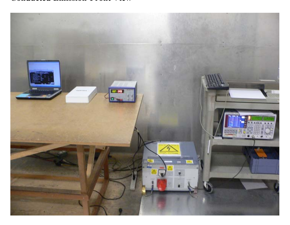
Conducted Emission-Rear View