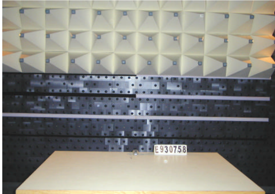
< REAR VIEW >