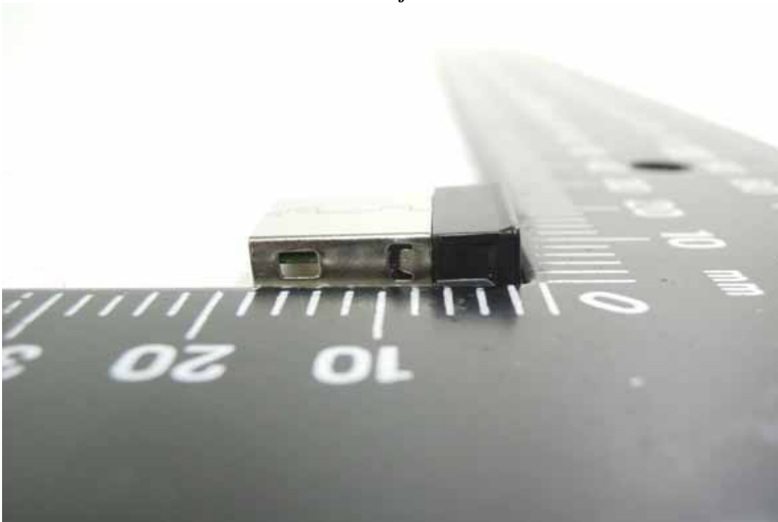
Side View of EUT - 4