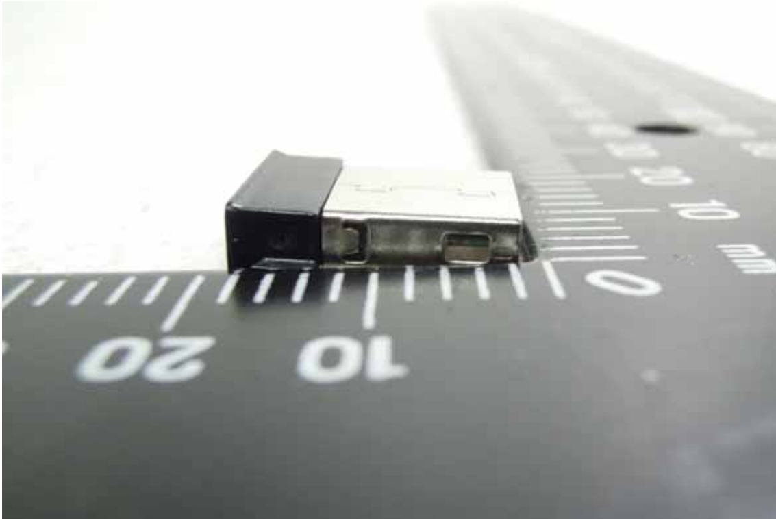
Side View of EUT - 2