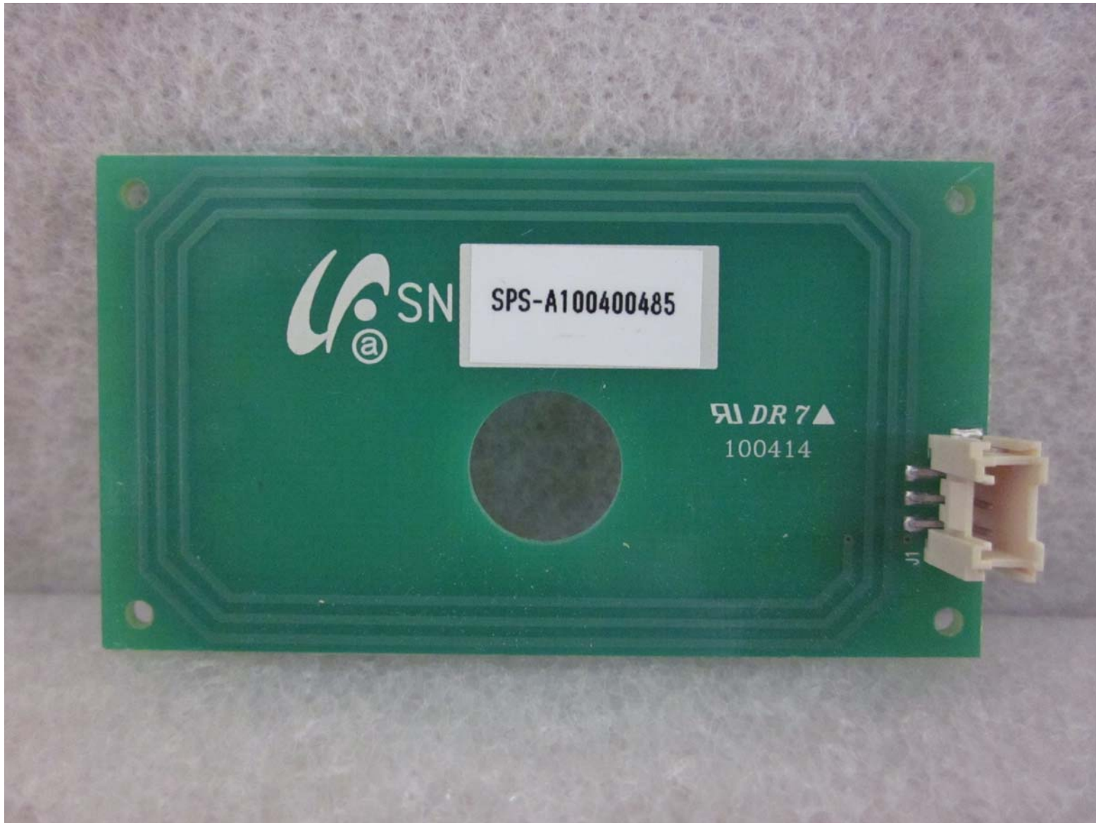
RFID Antenna_Rear of view