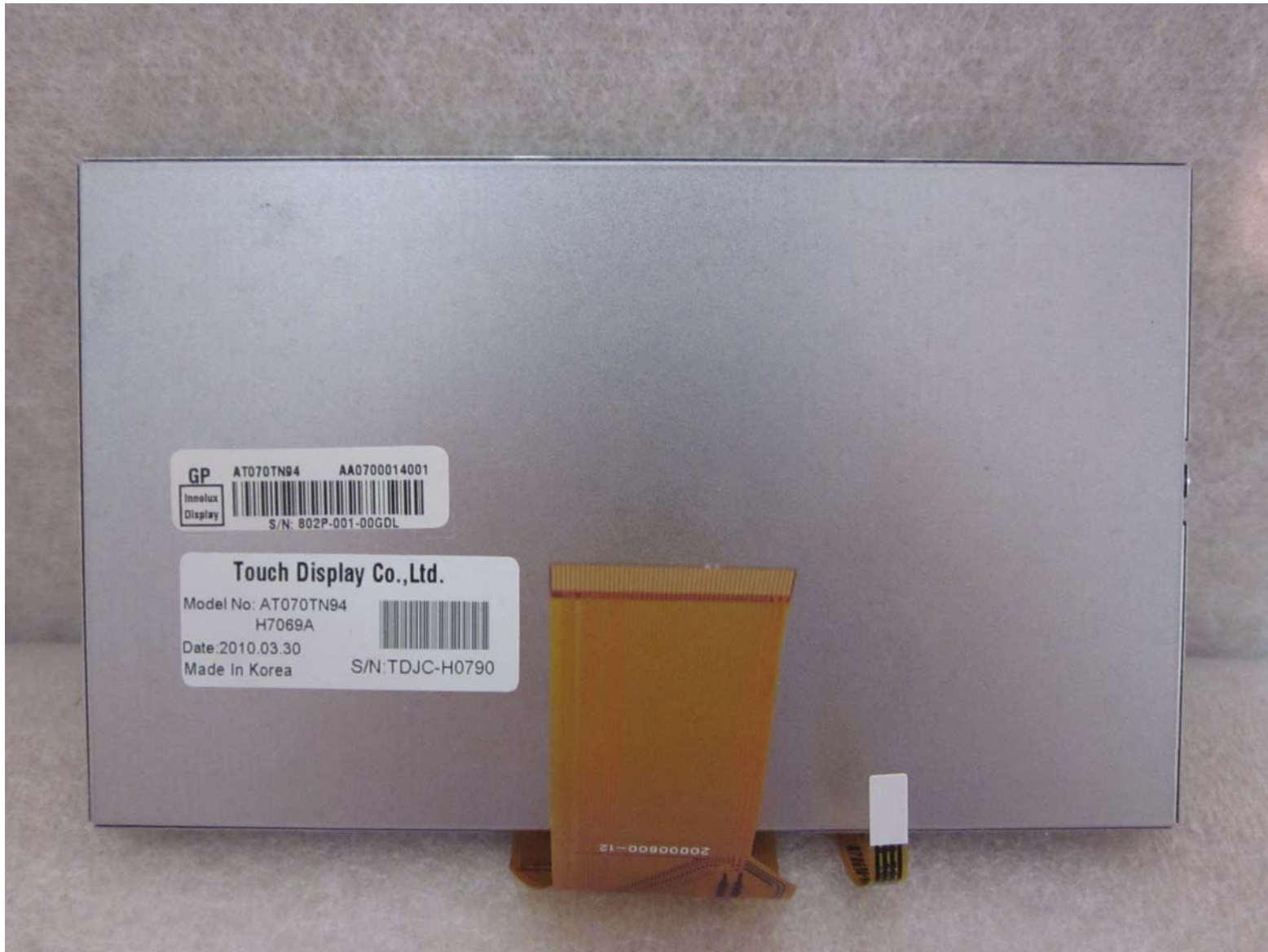
LCD Pannel_Rear of view