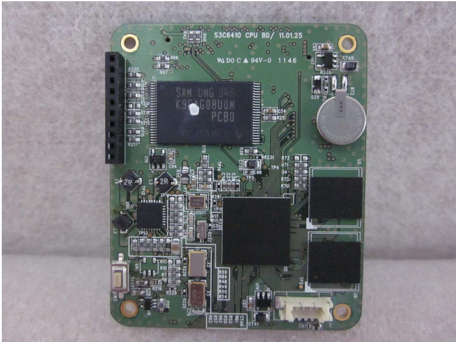
Sub PCB_Front of view