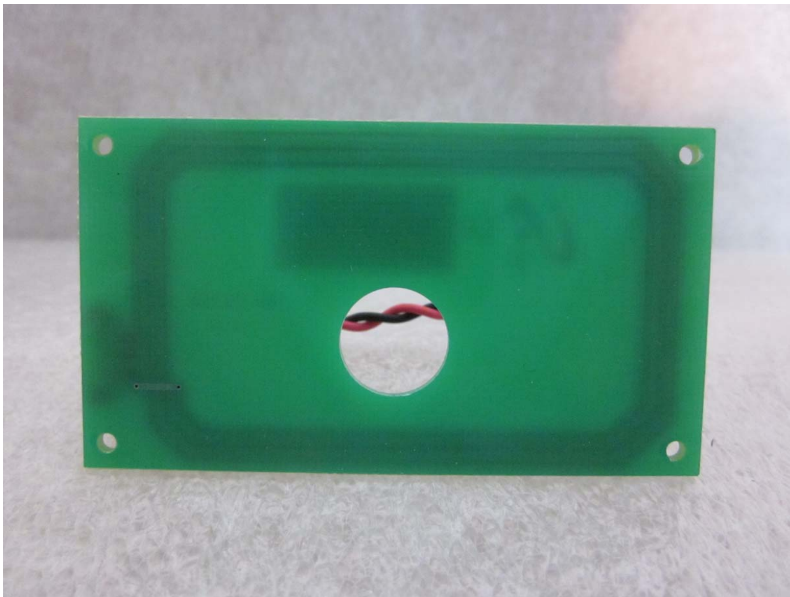
RFID Antenna_Front of view