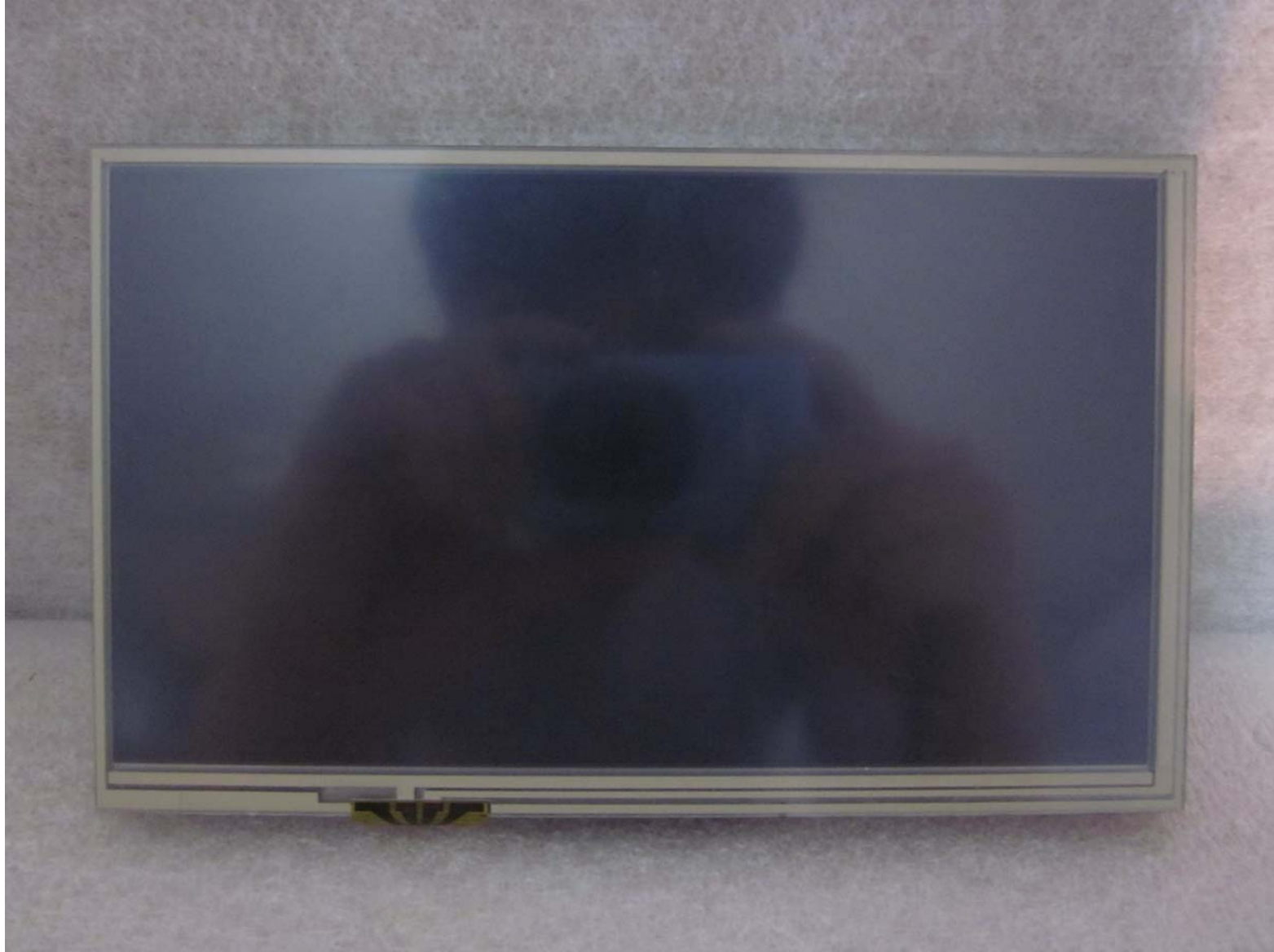
LCD Pannel_Front of view