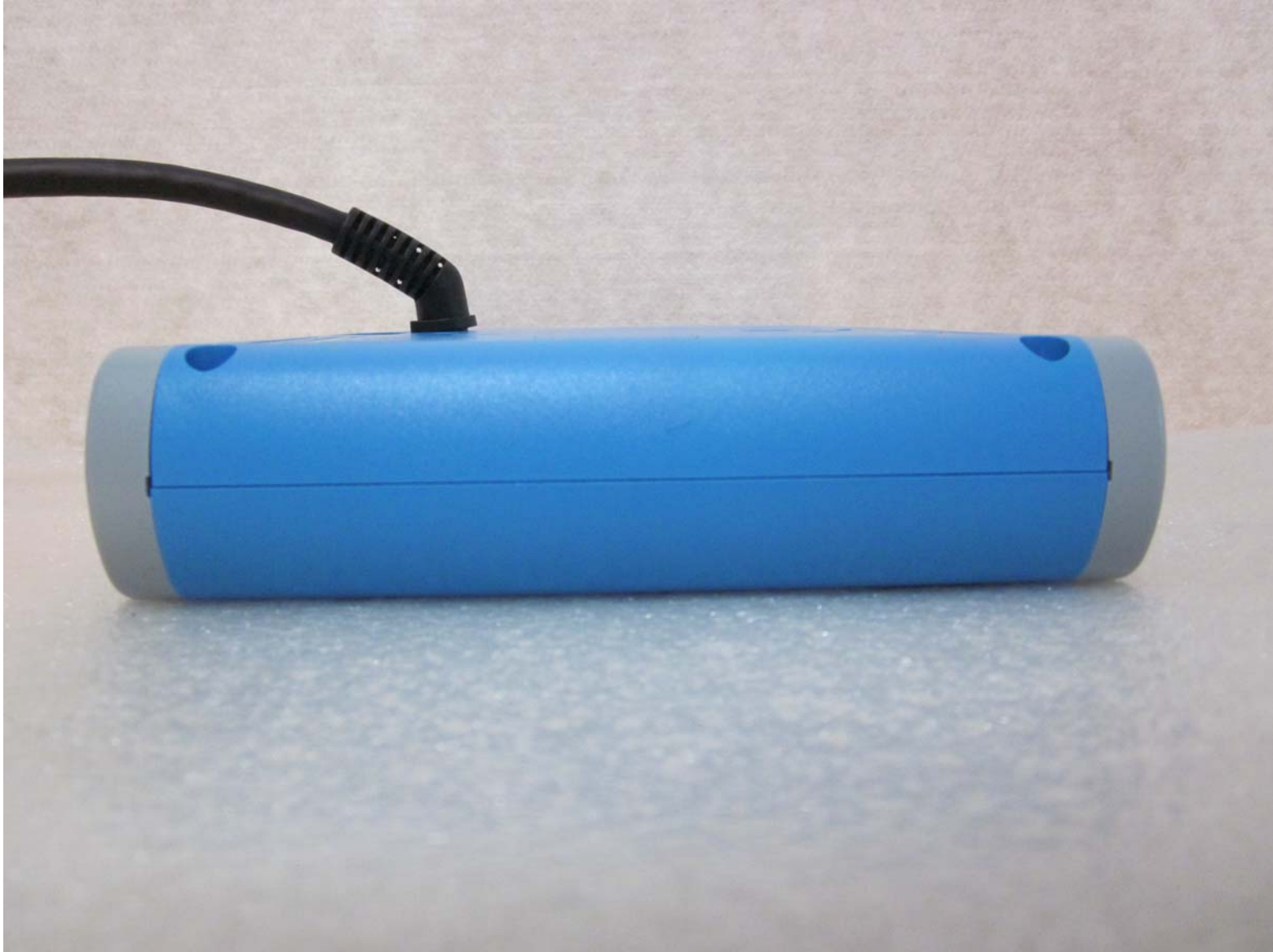
Left of view