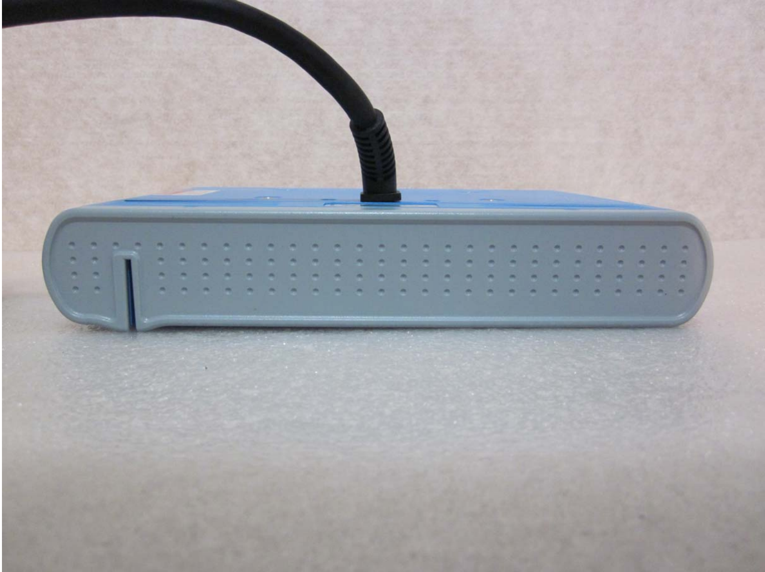
Bottom of view