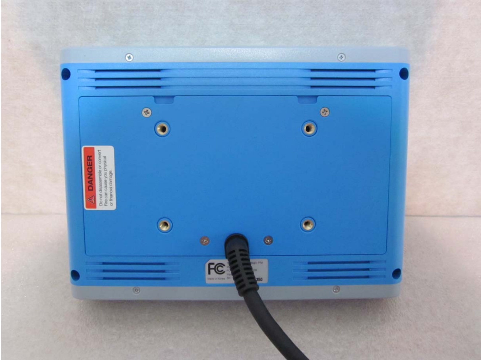
Rear of view