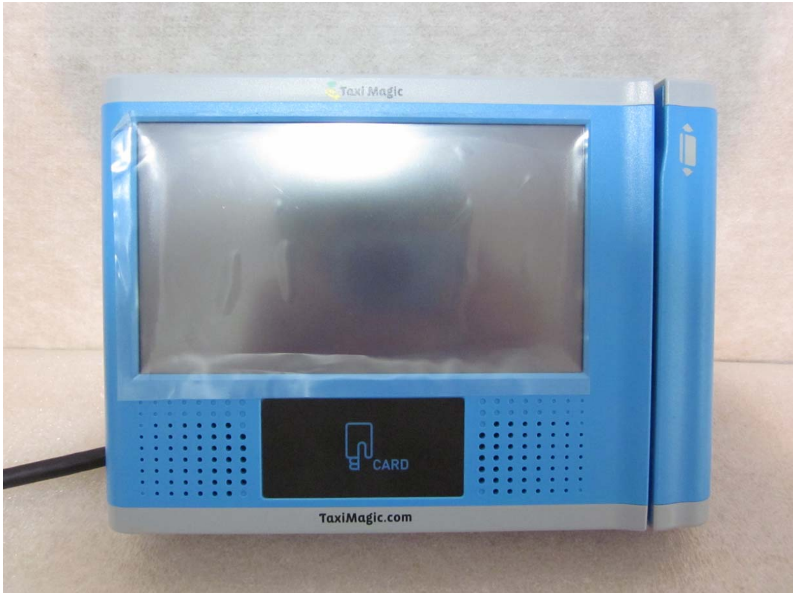
Front of view