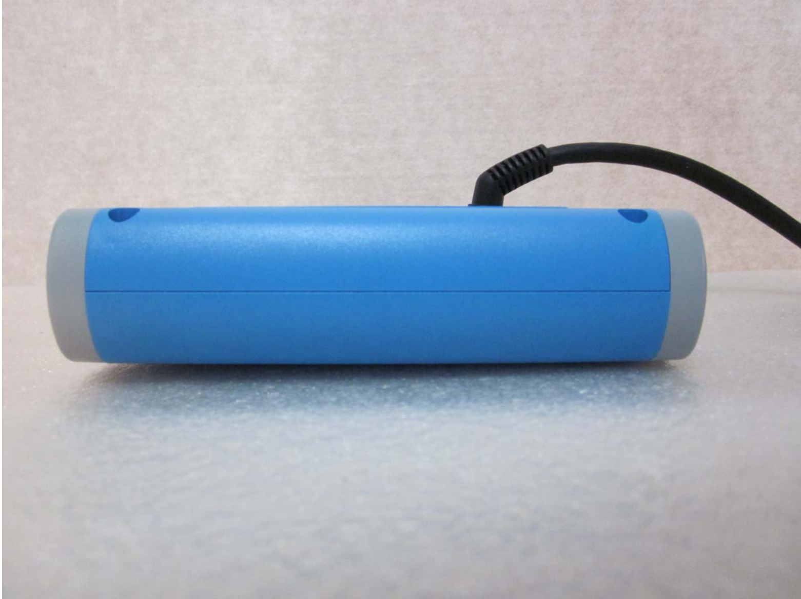
Right of view