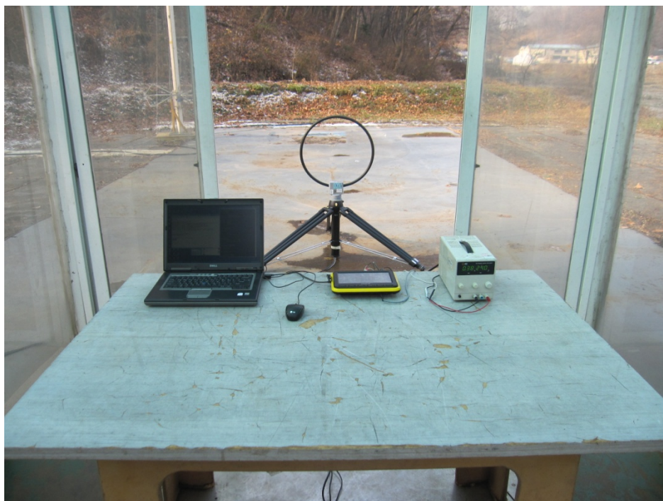
Radiated RF measurement (Below 30 MHz)