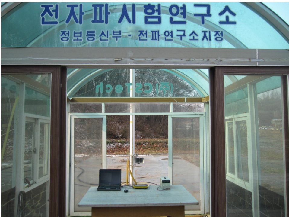
Radiated RF measurement (Above 1 GHz)