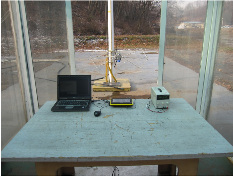
Radiated RF measurement (Below 1 GHz)