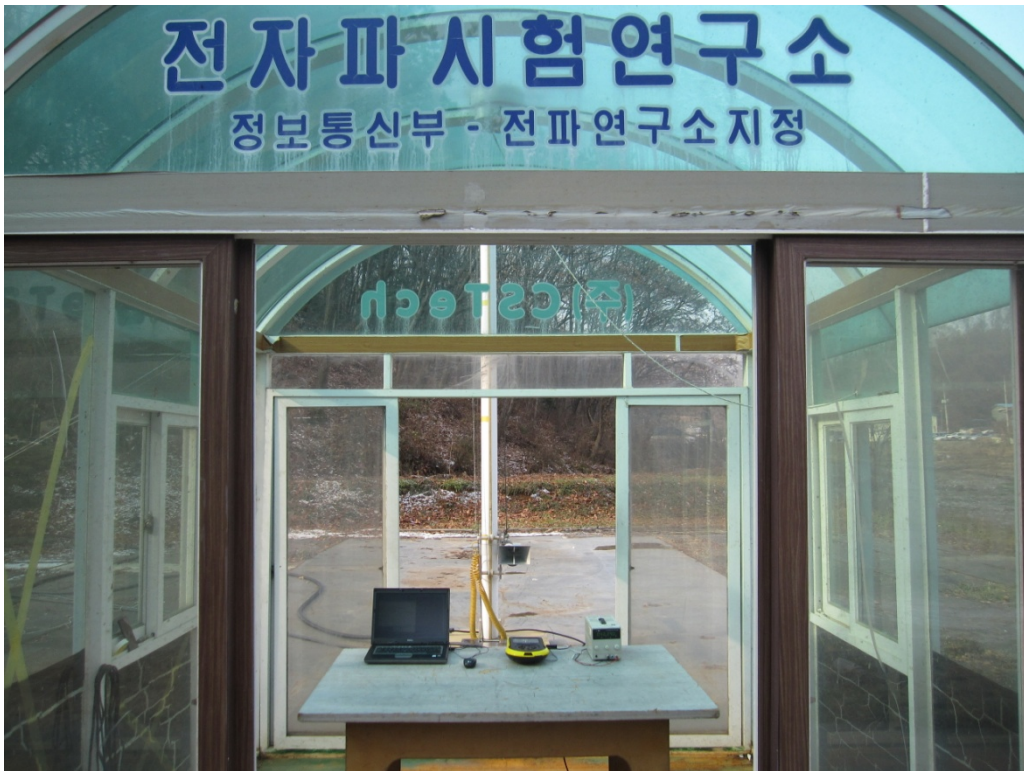
Radiated RF measurement (Above 1 GHz)