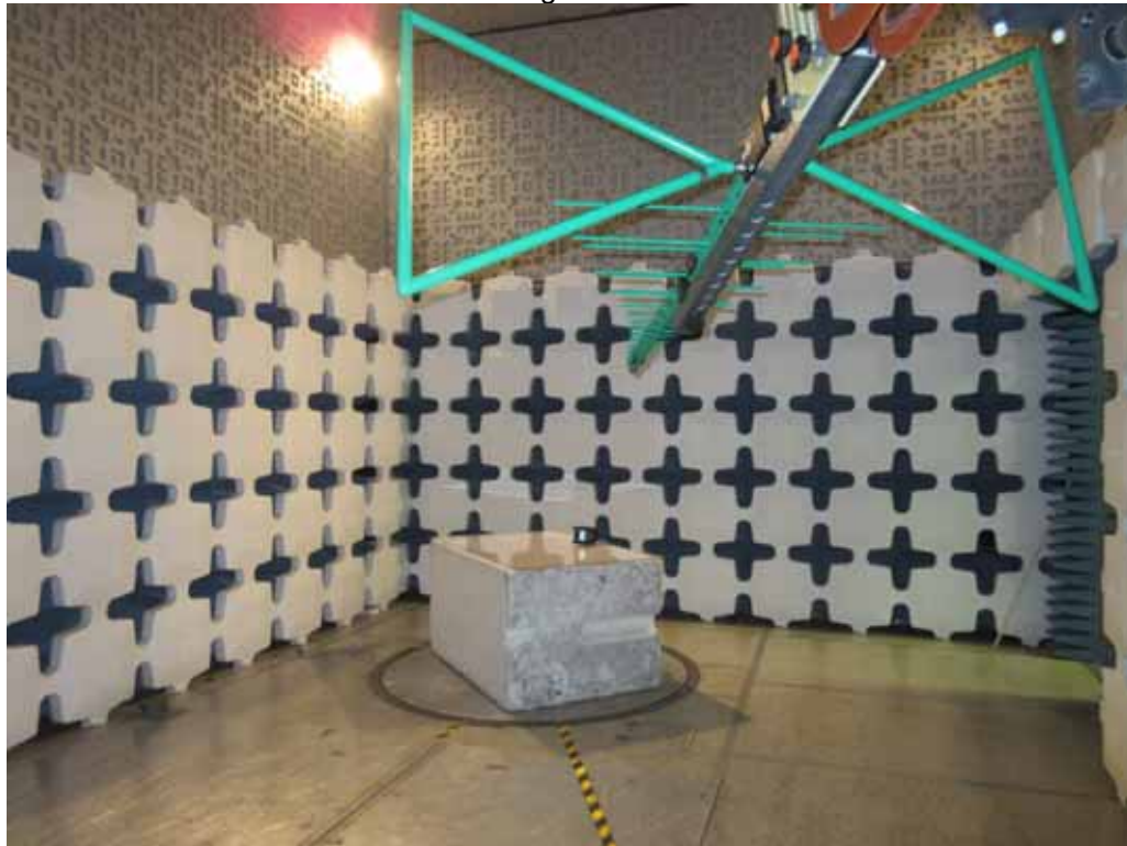
Test Setup for Radiated Emissions – 30MHz to 1GHz, Horizontal Polarization