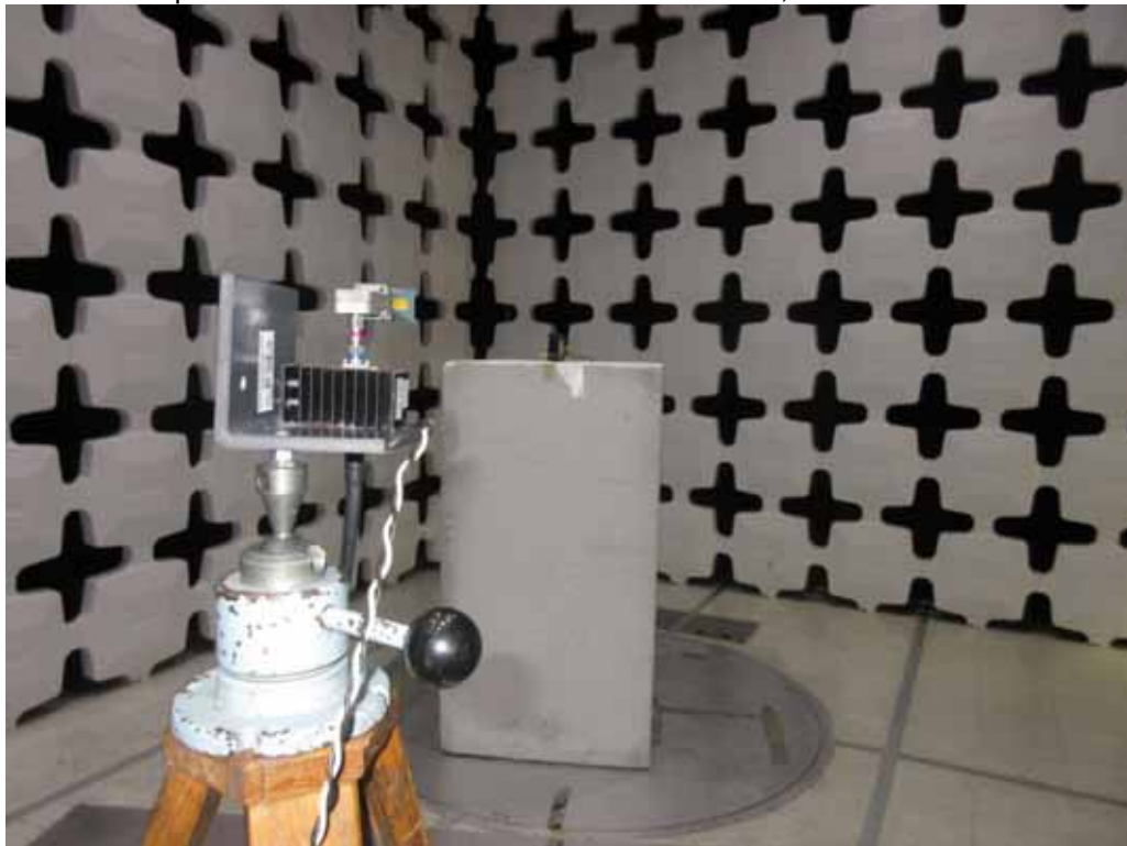
Test Setup for Radiated Emissions – 26.5GHz to 40GHz, Vertical Polarization