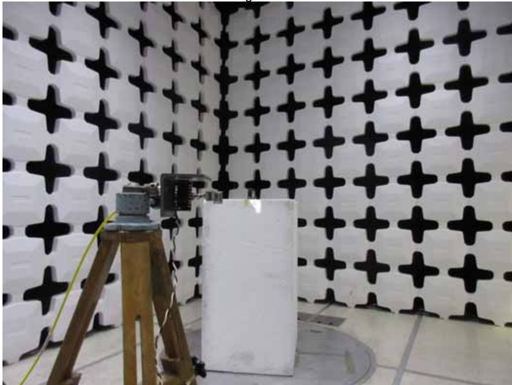
Test Setup for Radiated Emissions – 26.5GHz to 40GHz, Horizontal Polarization