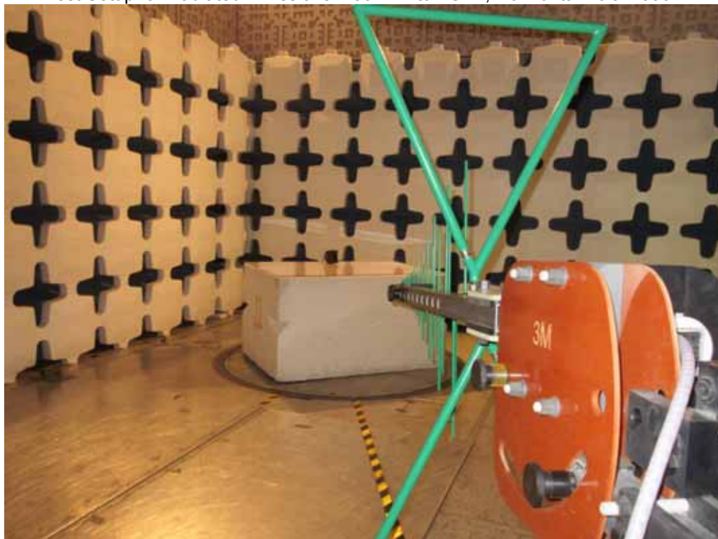
Test Setup for Radiated Emissions – 30MHz to 1GHz, Vertical Polarization