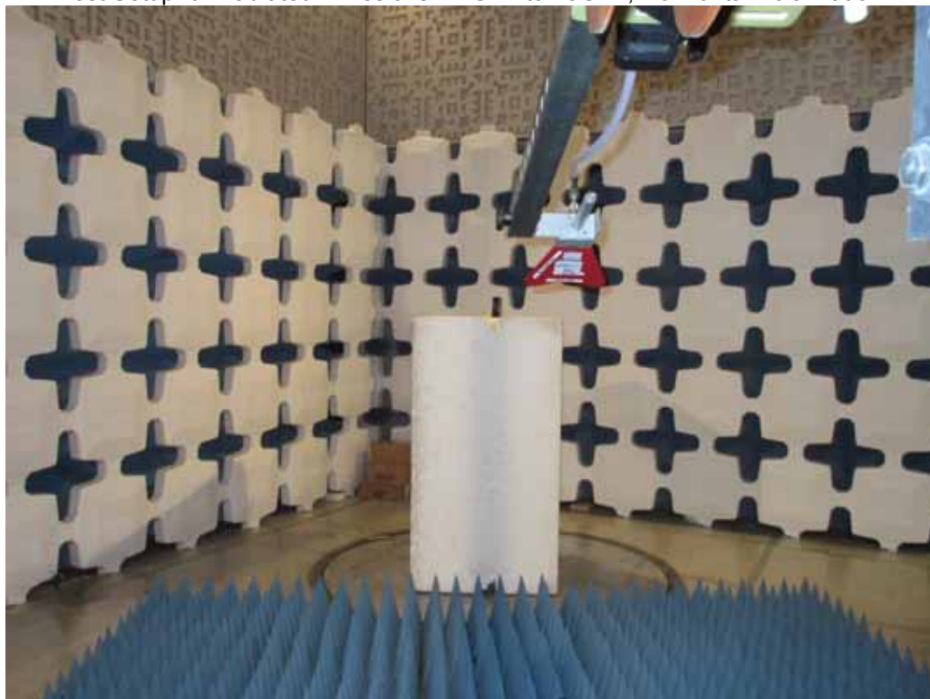
Test Setup for Radiated Emissions – 1GHz to 18GHz, Vertical Polarization