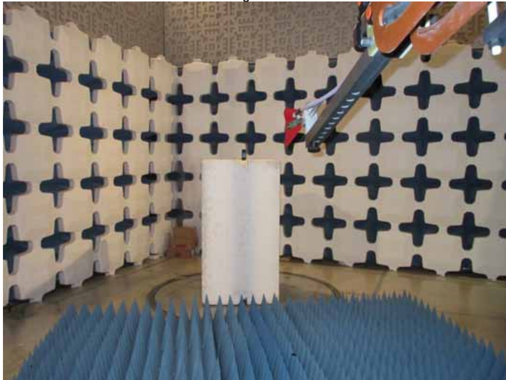
Test Setup for Radiated Emissions – 1GHz to 18GHz, Horizontal Polarization