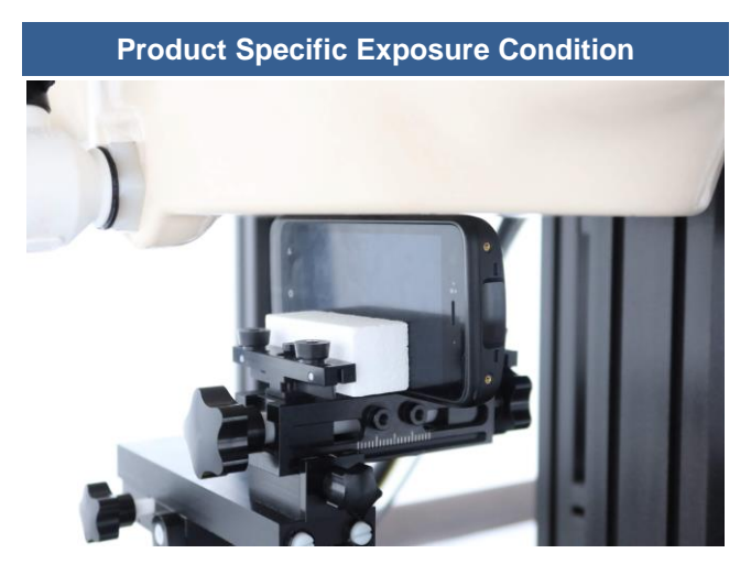
Left Side at 0 mm

TEL: 886-3-327-3456 Page: D3 of D3 FAX: 886-3-328-4978 Issued Date: Jul. 19, 2022