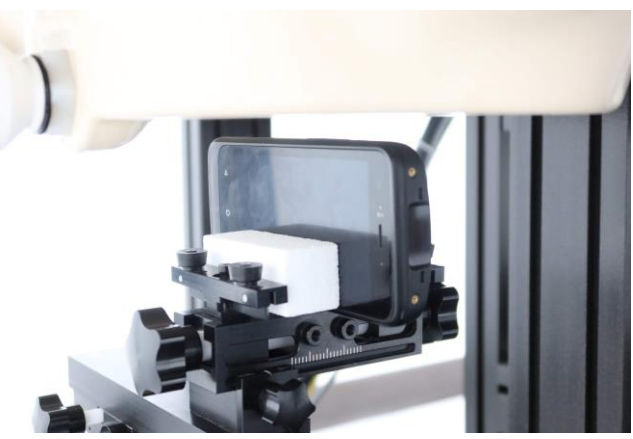
Left Side at 10 mm