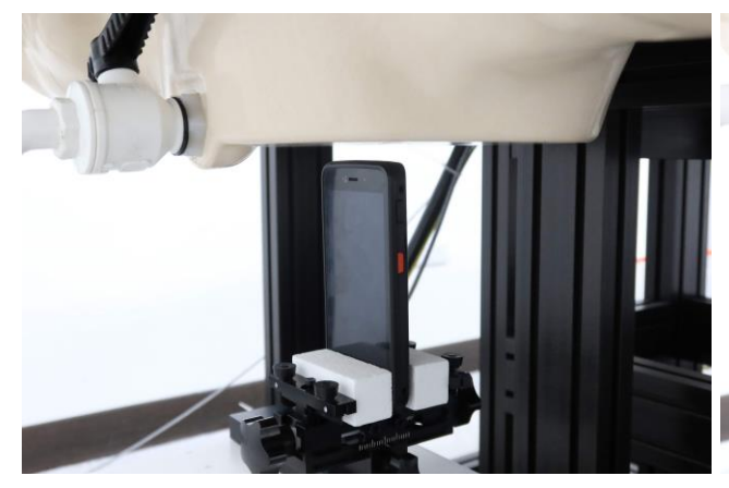
Top Side at 10 mm