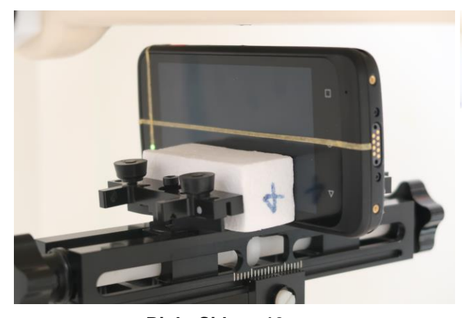
Right Side at 10 mm