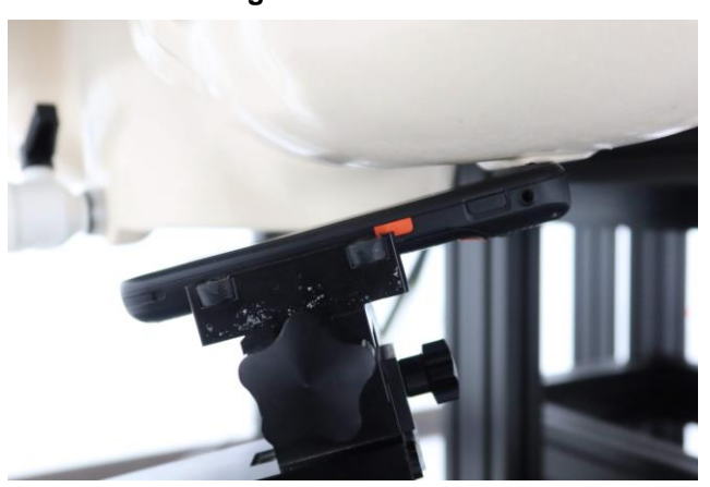
Left Tilted at 0mm

TEL: 886-3-327-3456 Page: D1 of D3 FAX: 886-3-328-4978 Issued Date: Jul. 19, 2022