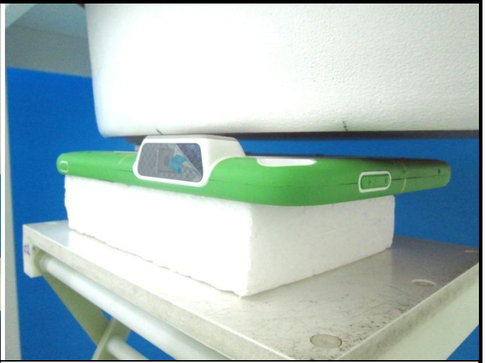
Rear Face of EUT with 1.3 cm Gap