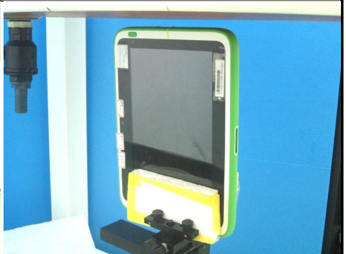
Right Side of EUT with 1.1 cm Gap