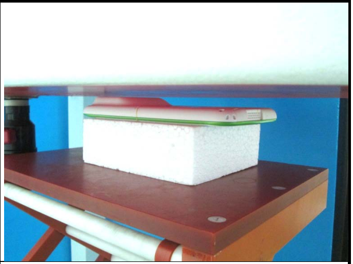
Rear Face of EUT with 5 mm Gap