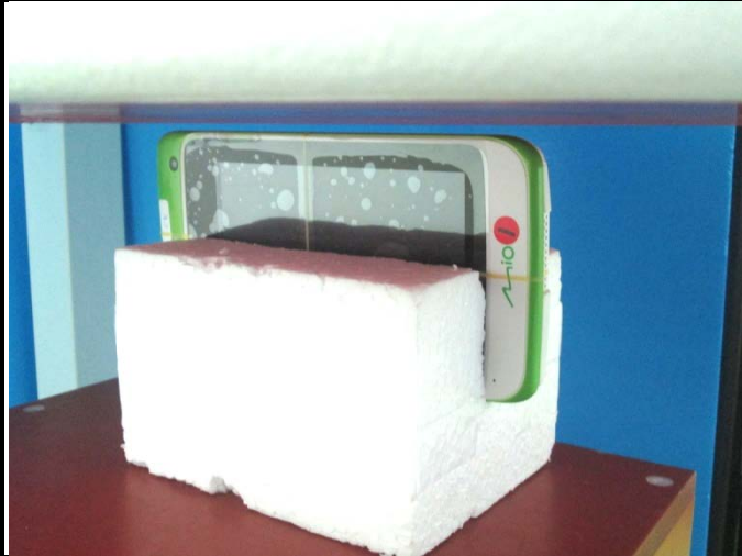
Right Side of EUT with 5 mm Gap