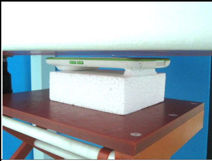
Front Face of EUT with 5 mm Gap