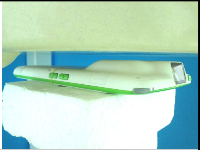
Rear Face of EUT with 5 mm Gap