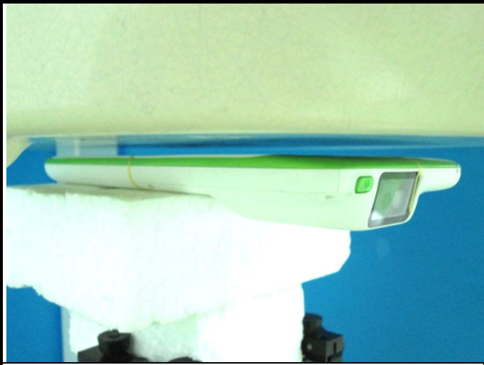
Front Face of EUT with 5 mm Gap