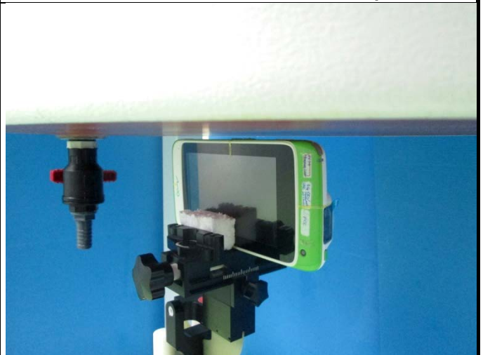
Left Side of EUT with 5 mm Gap