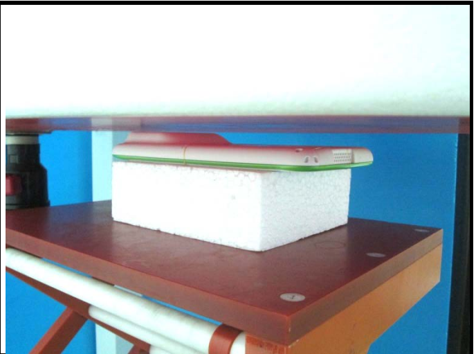
Rear Face of EUT with 5 mm Gap