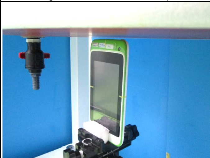
Top Side of EUT with 5 mm Gap