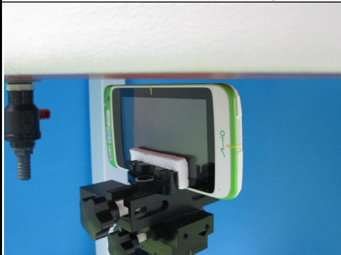
Right Side of EUT with 5 mm Gap