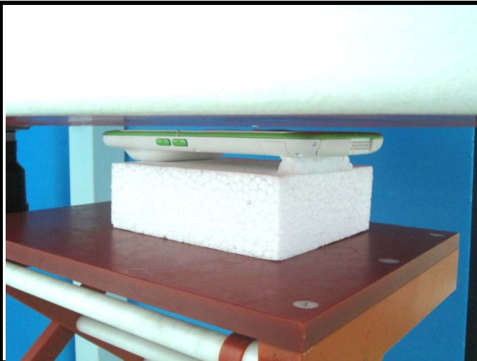
Front Face of EUT with 5 mm Gap