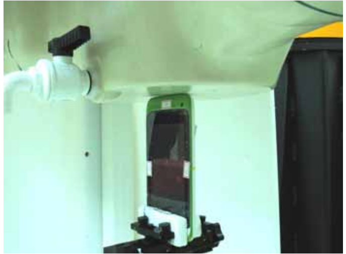
Secondary Portrait with 0 cm Gap