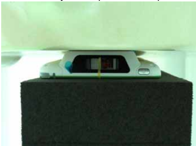
Rear Face of EUT with 0 cm Gap