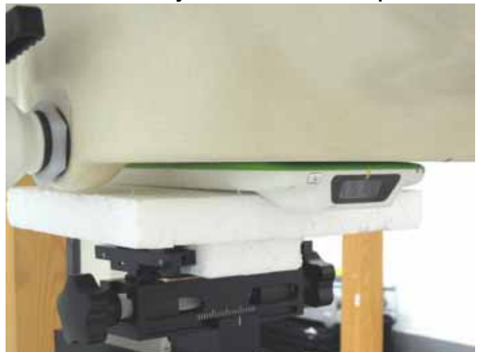
Front Face of EUT with 0 cm Gap