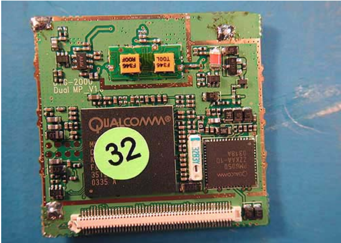
RF PCB Back