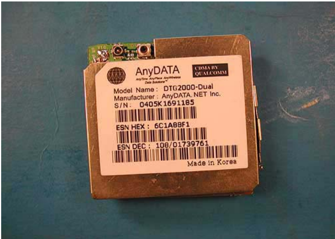
RF Section Frong