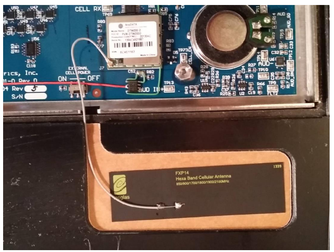
Cellular module and antenna detail, with adhesive removed