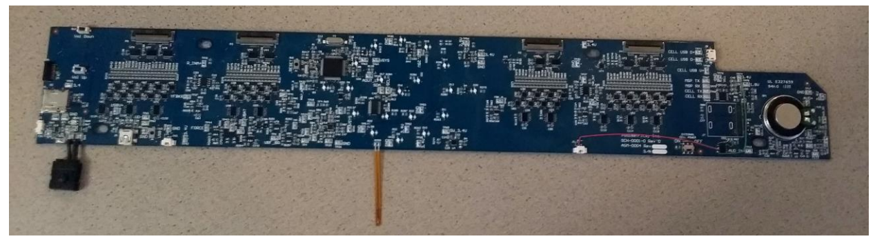
Top view of circuit board (with no cellular module populated)