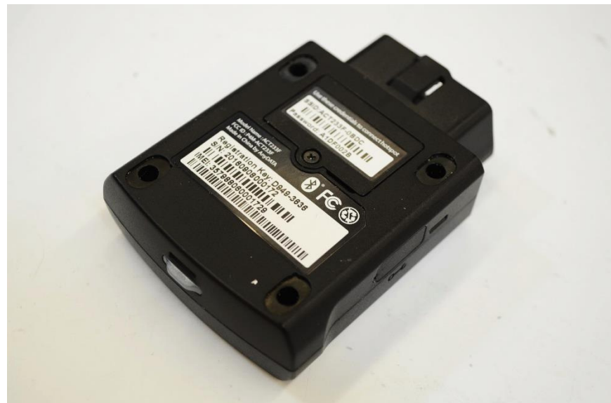
Equipment Under Test