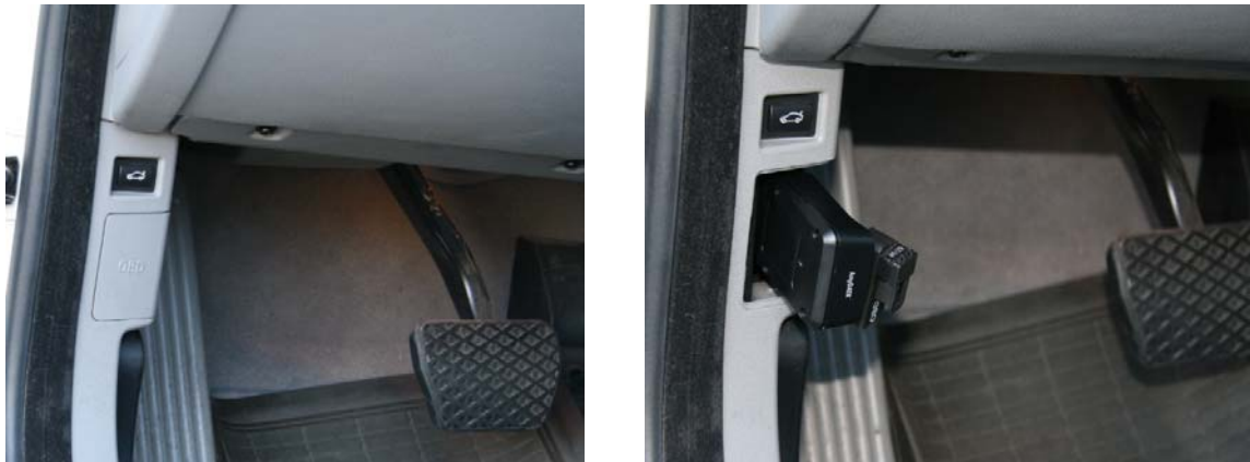
Figure 4.1: Installation of ACT231 in vehicle