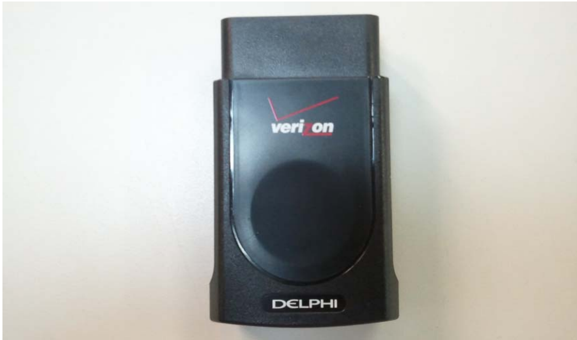
Figure 2.1: Package Contents