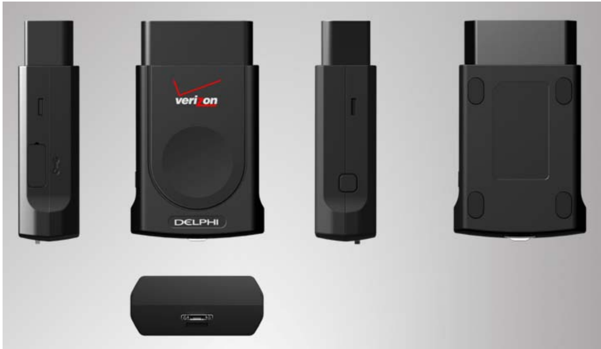
Figure 3.1: External Interface