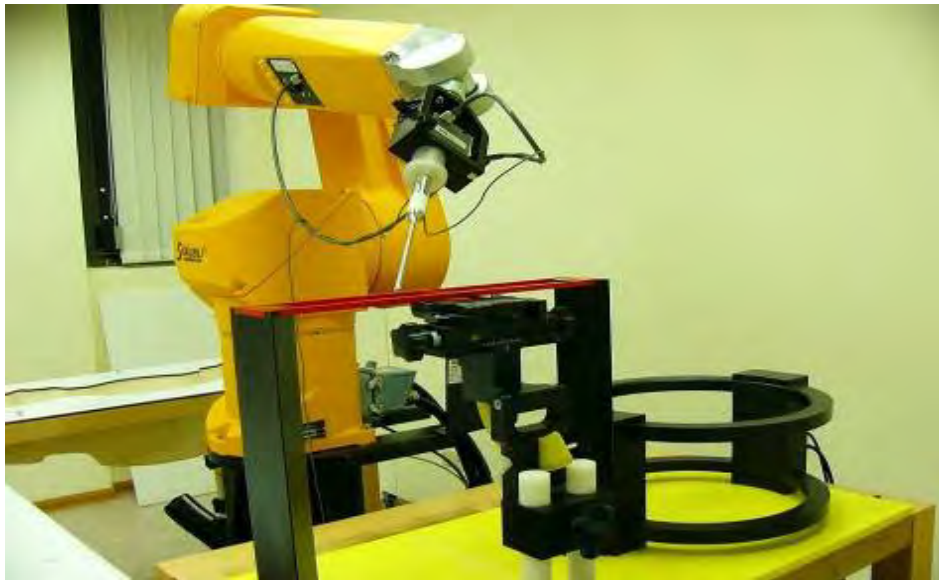
Fig. 1 Photograph of the DASY 5 measurement system