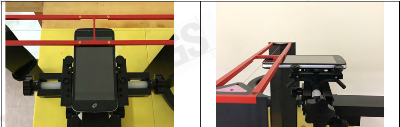
Fig. 2 Receiver of mobile contact center of Arch

Unless otherwise stated the results shown in this test report refer only to the sample(s) tested and such sample(s) are retained for 90 days only.