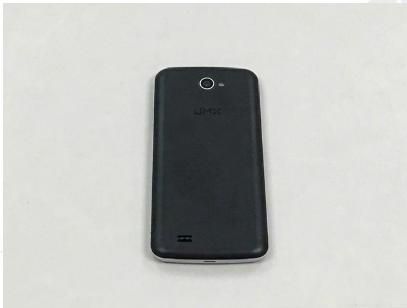
Fig. 4 Back view of EUT