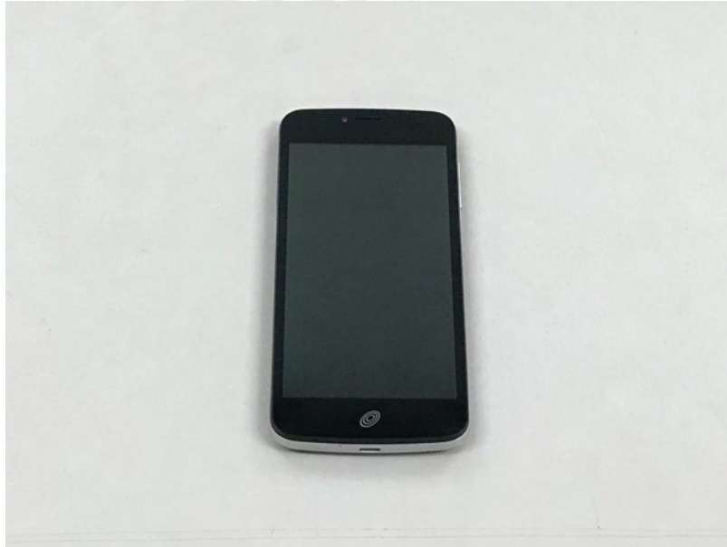
Fig. 3 Front view of EUT