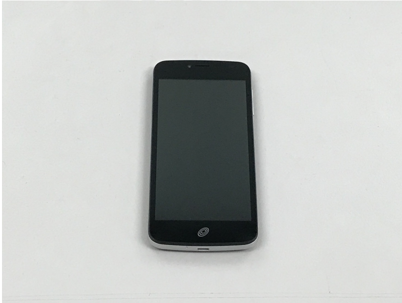
Fig. 2 Front view of EUT