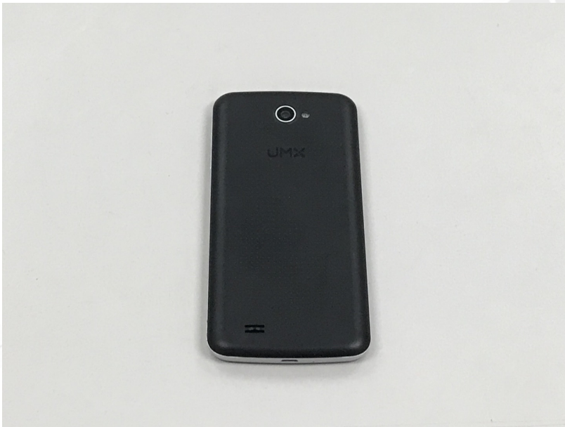
Fig. 3 Back view of EUT