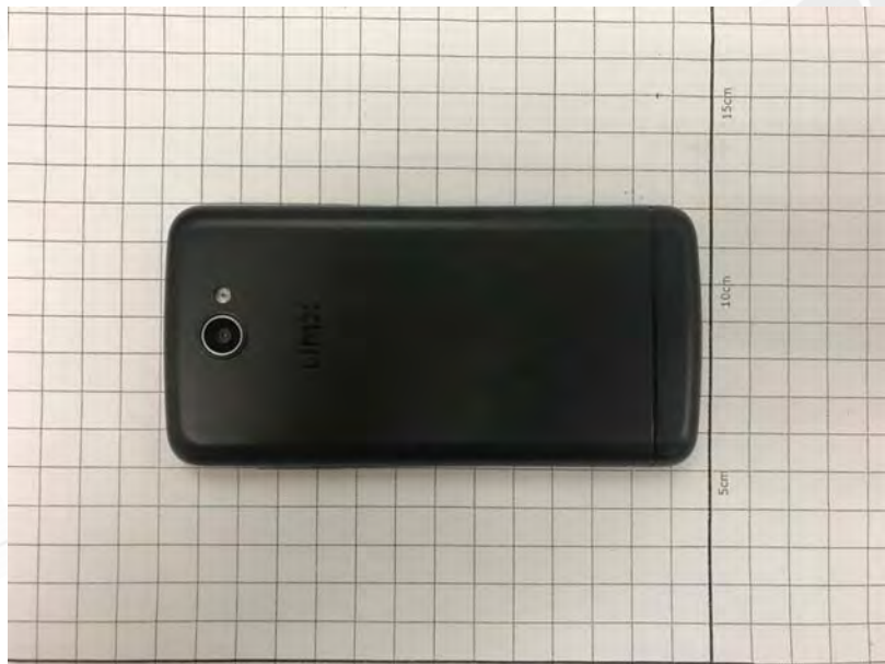
Fig. 3 Back view of EUT