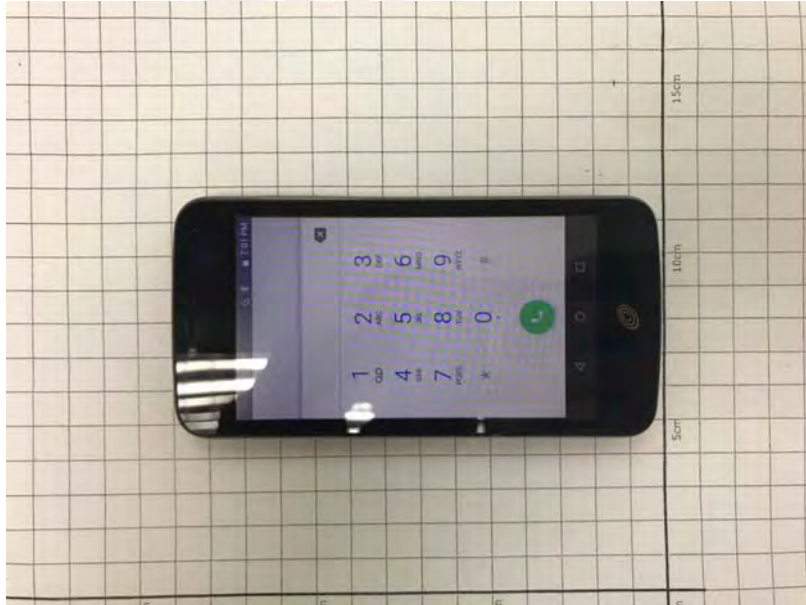
Fig. 2 Front view of EUT