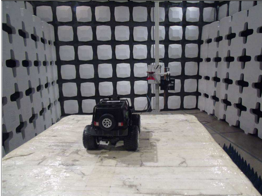
Frequency Range < Above 1GHz >