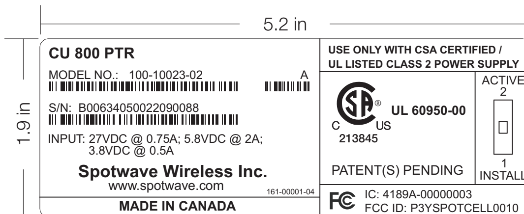
Coverage Unit Approval Label