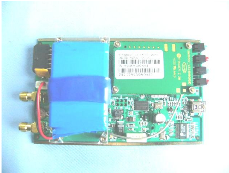
EUT inside whole view