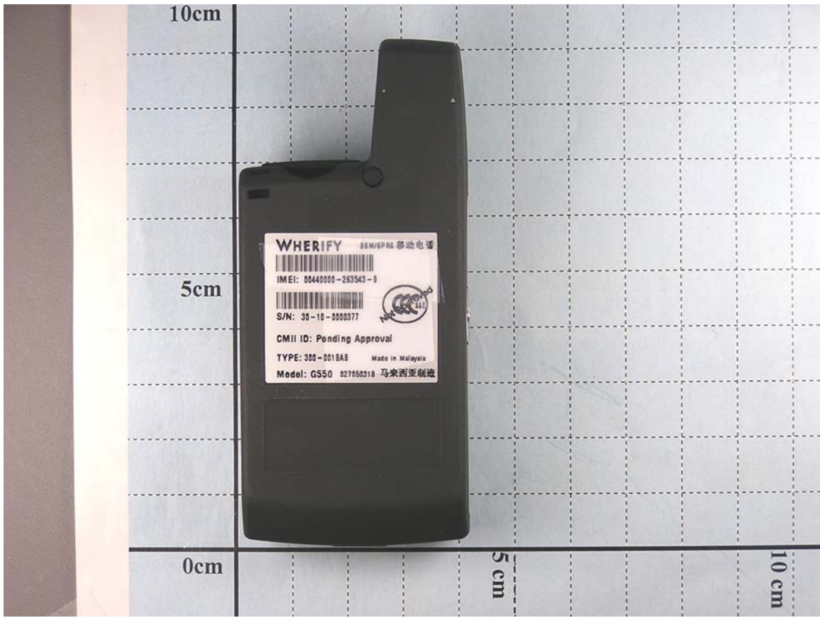
EUT – Bottom view