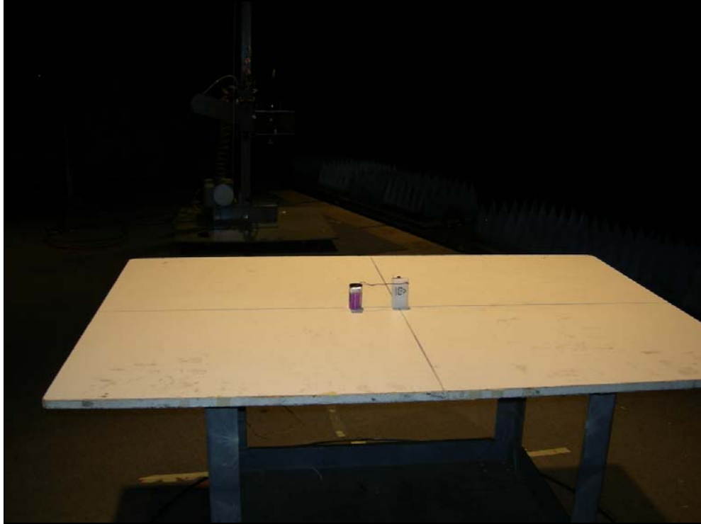
Figure 4: Radiated Emissions – Internal Antenna – ZPOS