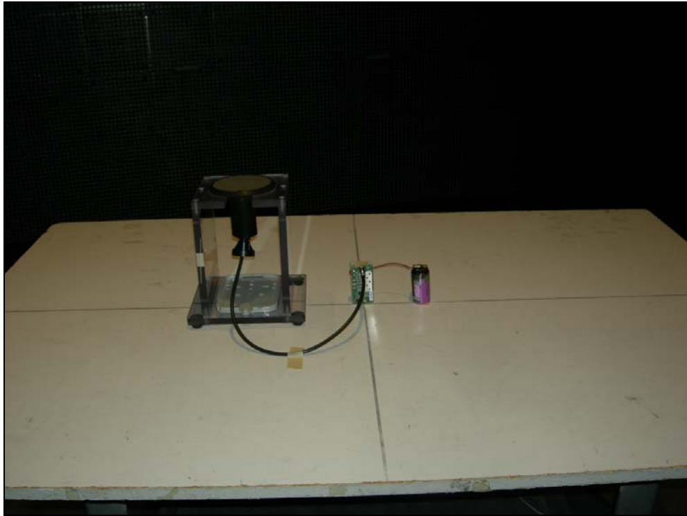
Figure 1: Radiated Emissions – External Antenna – ZPOS