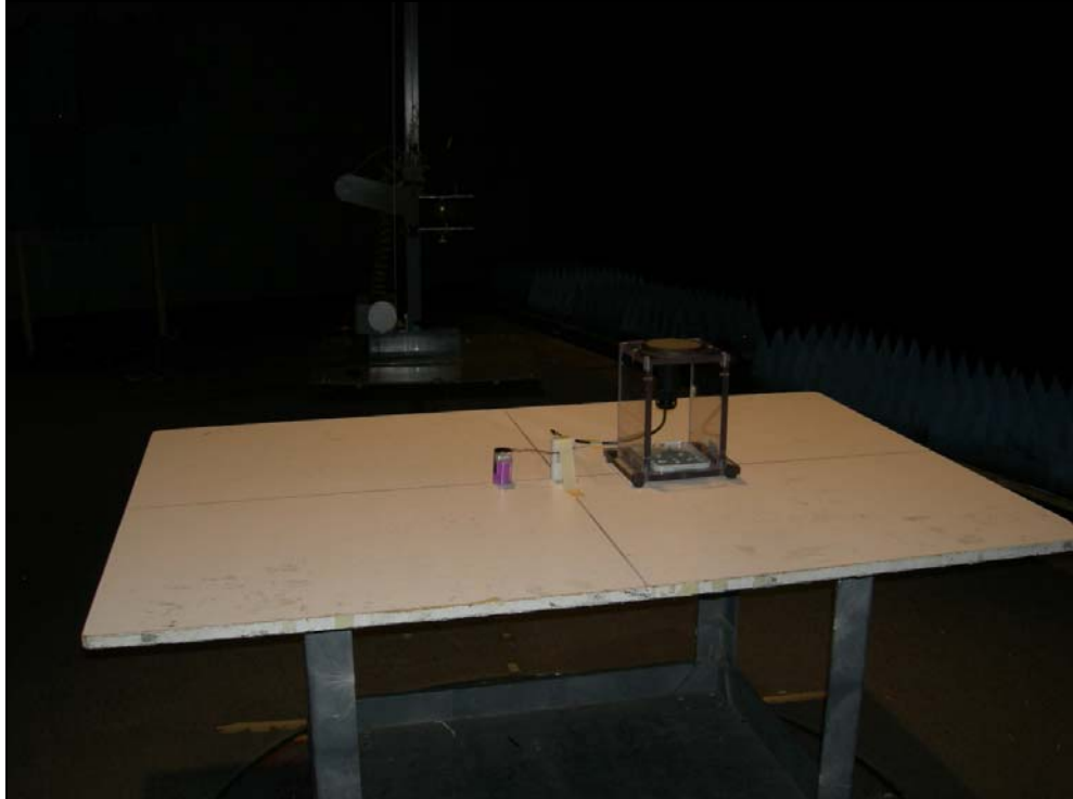
Figure 2: Radiated Emissions – External Antenna – ZPOS